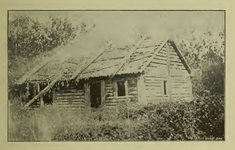
ABANDONED POST (Toad River, Liard)

Lieutenant Schwatka, commissioned by the U.S. Govern-