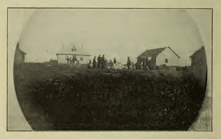
PEEL'S RIVER POST (Fort McPherson)

While the ardent explorers, along the west of the mountains, had been thus doing their work, another movement was