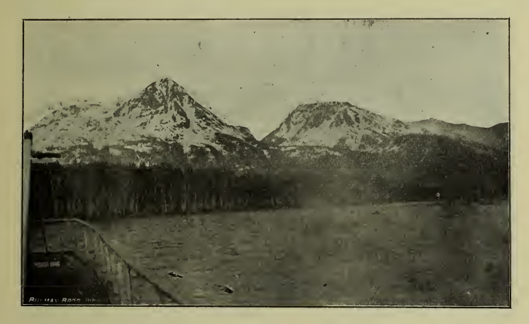
VIEW ON THE UPPER STIKINE