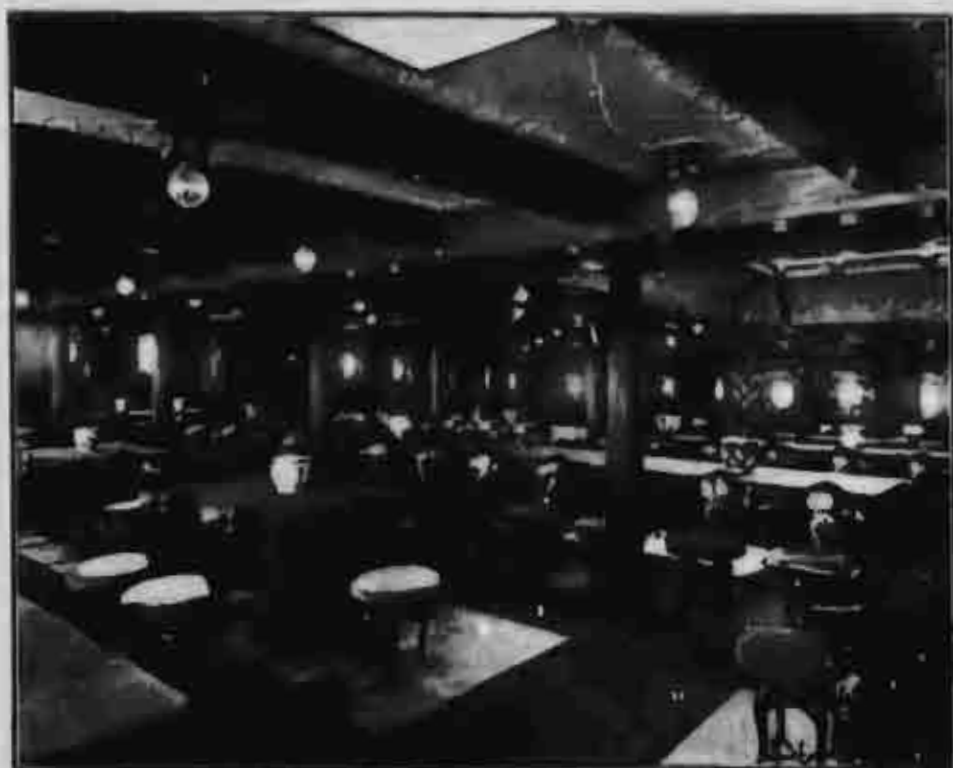
S.S. VIRGINIAN—DINING SALOON

provide an unbroken yearly service. The Grand Trunk Railway was completed to Portland that very year, 1853, and therefore Portland became the winter terminus of the new steamship line. However, the Intercolonial was yet to come as a condition of Confederation. It was completed in 1876, connecting Quebec with Halifax, which thereafter became the winter port of the Allan Line of Royal Mail Steamships. Six years later the fortnightly service was increased to a weekly service, which has been continued ever since.