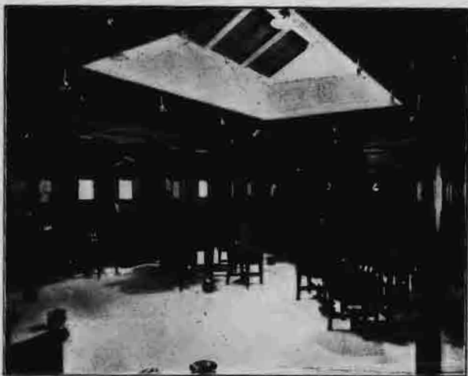
S.S. VICTORIAN—SMOKING ROOM

modation was even just a decade ago. There has been good reason for these changes. Canada, within the last ten years at least, has enjoyed a tremendous impetus, and travellers and tourists of all manner and means are coming this way, and in increasing numbers, by the direct steamship routes. Travellers have come to know that accommodation on the best Canadian steamships is first class, and Canadians themselves have at last come to be not afraid of being regarded as a little provincial if they patronise home industry on the great seas. Trade with Great Britain has also advanced with enormous strides, and therefore the steamship companies have felt warranted in providing a service that would compare with the best anywhere. There are two advantages to Canada—shortness of route and natural beauty of scenery along the St. Lawrence River from the Gulf to Montreal. These two things, shortness of route and beauty of scenery, are really of great importance. Of all the persons who travel, almost