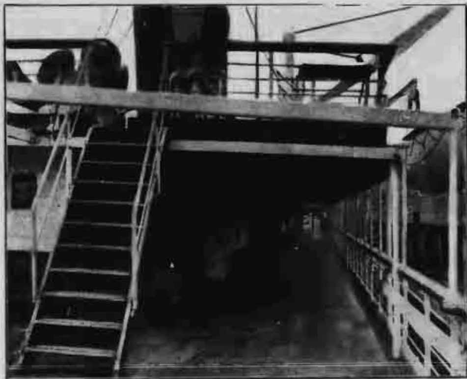
PROMENADE DECK—ALLAN TURBINE STEAMSHIPS

rate of twenty-two knots an hour. To the inexperienced mind that appears to be tremendously out of proportion. If it takes, say, 250 tons of coal a day to run one of the Allan turbine steamers at an average speed of seventeen knots an hour, the difference between the cost of running a vessel of that type and one of the large Cunarders of a speed of twenty-five knots would be readily appreciated, especially when it is considered that the latter will consume four or five times as much coal. But coal is not the only thing. There are as well the men to handle it, the space to put it in, and the men also to run the extra large engines. Each of the Allan turbine steamships employs a crew of 350, while a crew of one of the large Cunarders numbers well up towards 1,200. The Allan turbiner Victorian or Virginian is well equipped with a crew of 350. So large an army of men as 1,200 working in the lower portions of a vessel at sea is a thing of tremendous significance, and it might well be regarded as a real menace rather