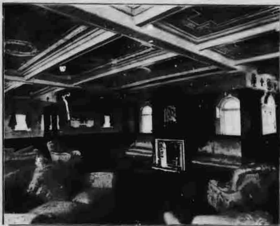
S.S. VIRGINIAN—MUSIC ROOM

It should be remembered that at that time the Intercolonial Railway had not been undertaken, and so there was no railway between the Maritime Provinces and the west. Montreal was the summer terminus on this side, but there had to be as well a winter terminus in order to