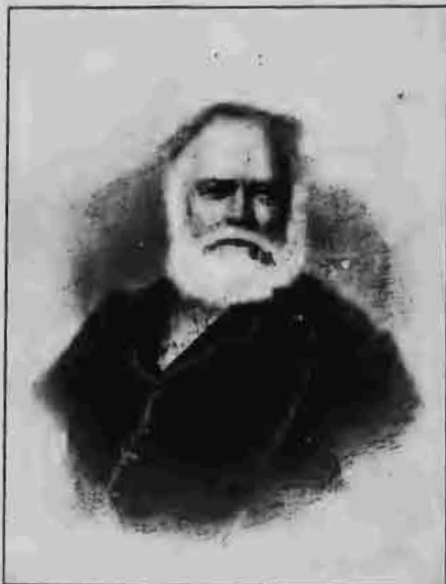
SIR HUGH ALLAN, WHO FOR MANY YEARS WAS A PROMINENT FIGURE IN CANADIAN SHIPPING CIRCLES