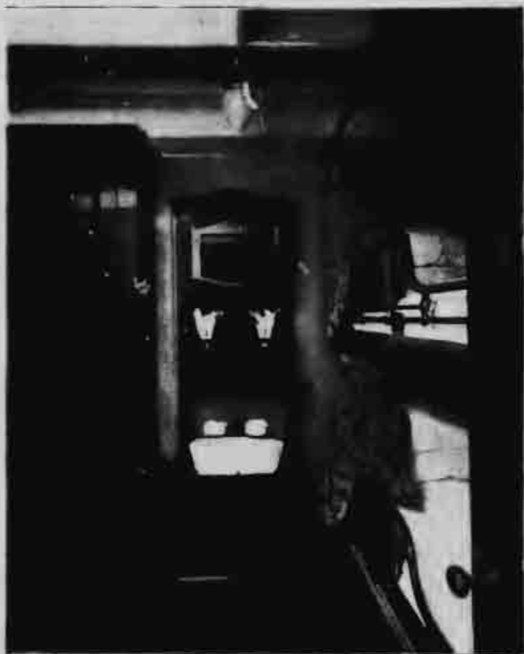
TYPE OF FIRST-CABIN STATEROOM IN ALLAN TURBINE STEAMSHIPS.

Perhaps the greatest question before steamship owners all over the world just now is, What is the maximum of size and speed in keeping with profitable operation? That question seems to apply with particular fitness here in Canada. We hear a great deal of talk about a fast mail service, about short routes, and about summer and winter ports, but it is doubtful whether the general public, and even many of those who do a good deal of the talking, really appreciate the meaning of what they presume to discuss. While this article is not intended to be a technical consideration of the economic of shipbuilding and ship operating, there is at the same time a hope that it may serve to give some idea of what a great and involved problem a serious consideration of the ocean transportation question really is. According to conditions in Canada, two