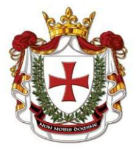
ORDER OF SERVICE

Saturday, 18<sup>th</sup> October 2014 Bristol Anglican Cathedral, England