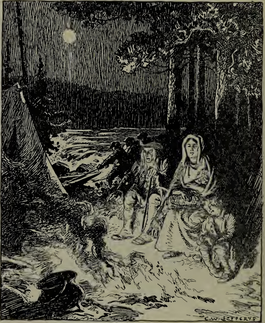
Loyalist Refugees on the St. Lawrence