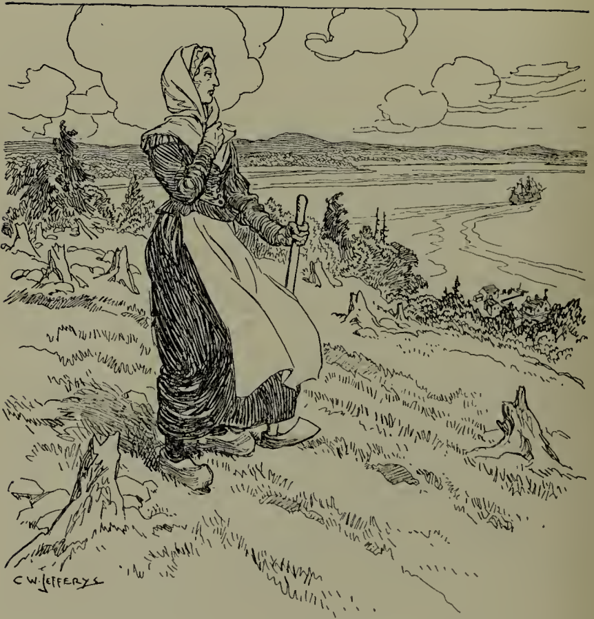
Madame Hébert Watching the Departure of the French after the Capture of Quebec, 1629.

"She and her family would cling to their own soil."