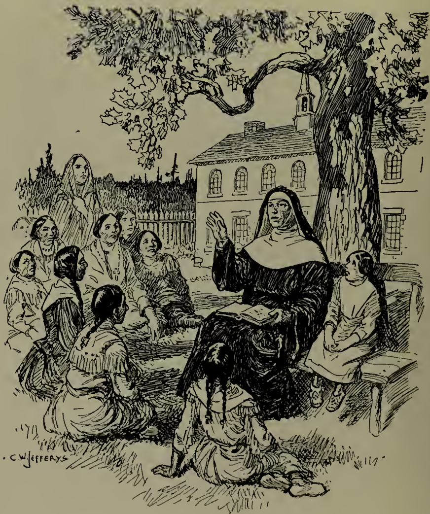
Marie de l'Incarnation Teaching Indian Children under the Oak Tree at the Ursuline Convent.