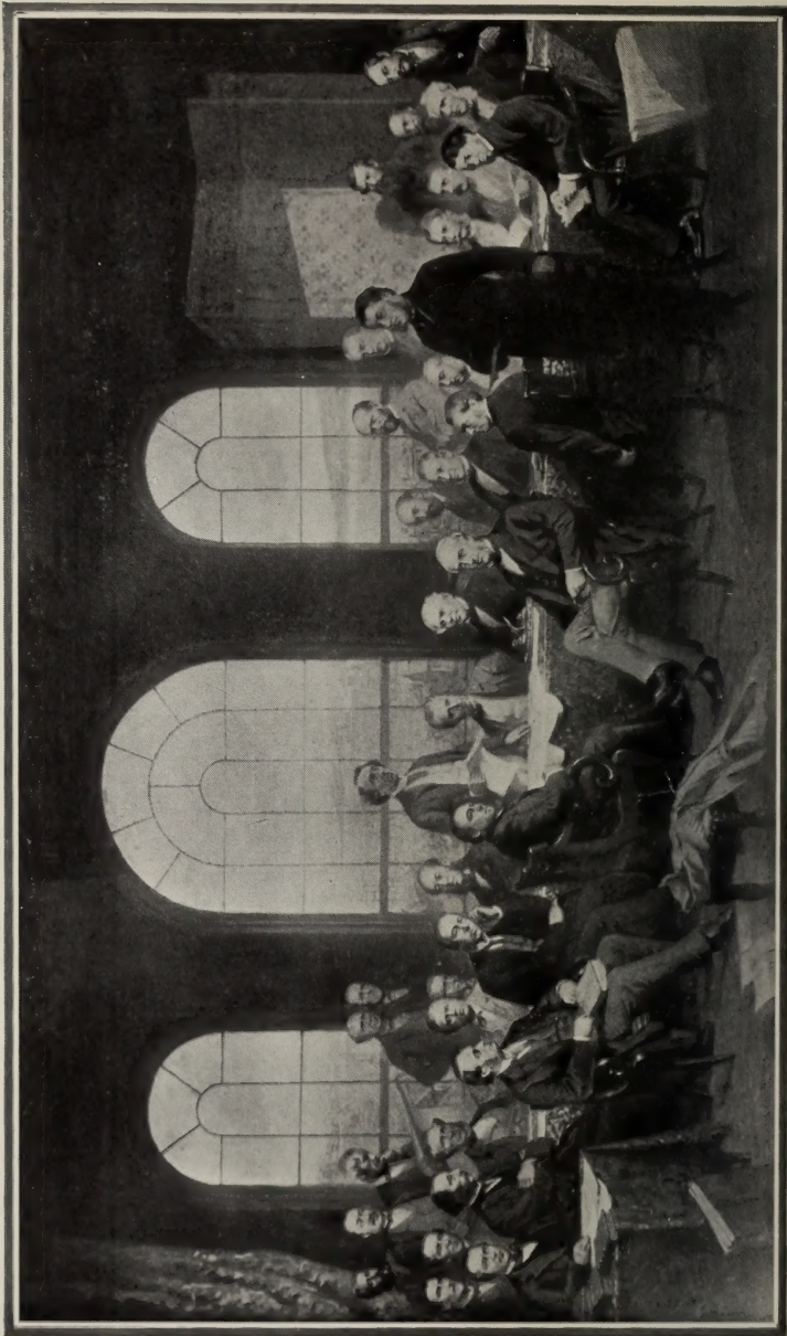
THE FATHERS OF CONFEDERATION From the painting by Robert Harris