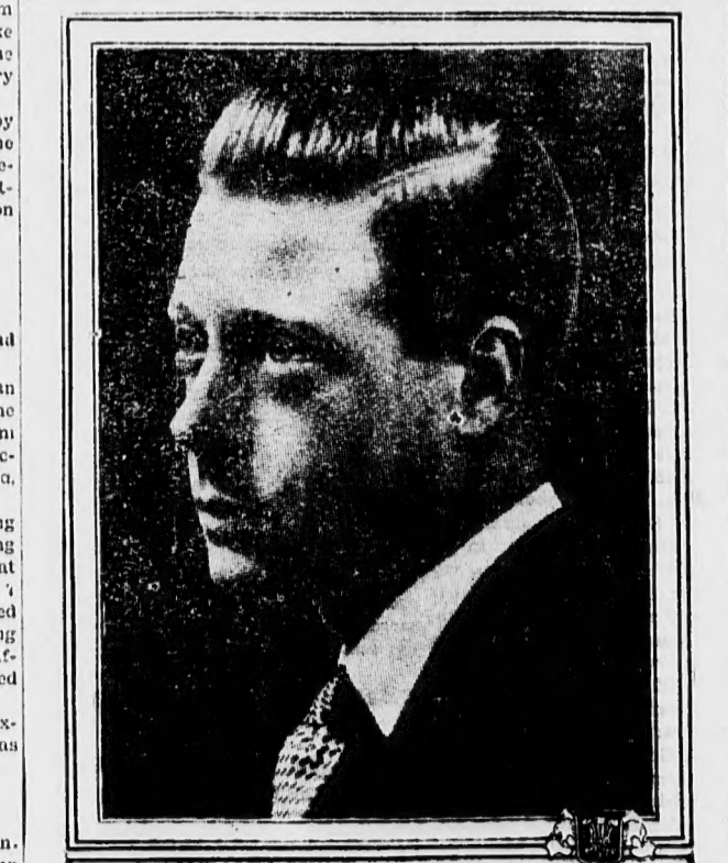
Here is reproduced a photograph of the Prince of Wales which was taken from the Illustrated London News. This picture is declared to be the best ever secured of the young man who recently returned from the big game haunts of Africa to the sick room of his father, King George.