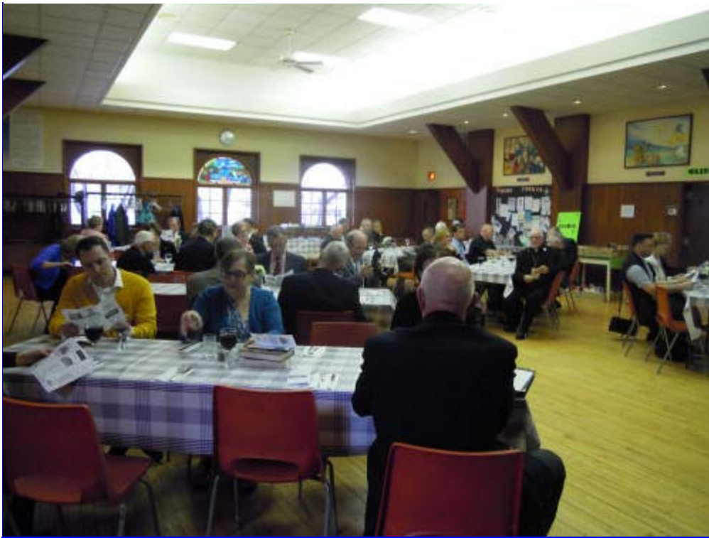
Priory members studying the volunteer opportunities brochure