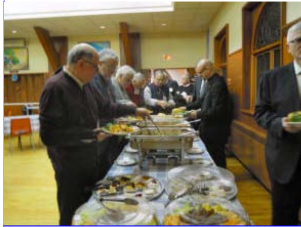
Priory donations committee deliberating the annual donations recommendations and a picture from our dinner evening