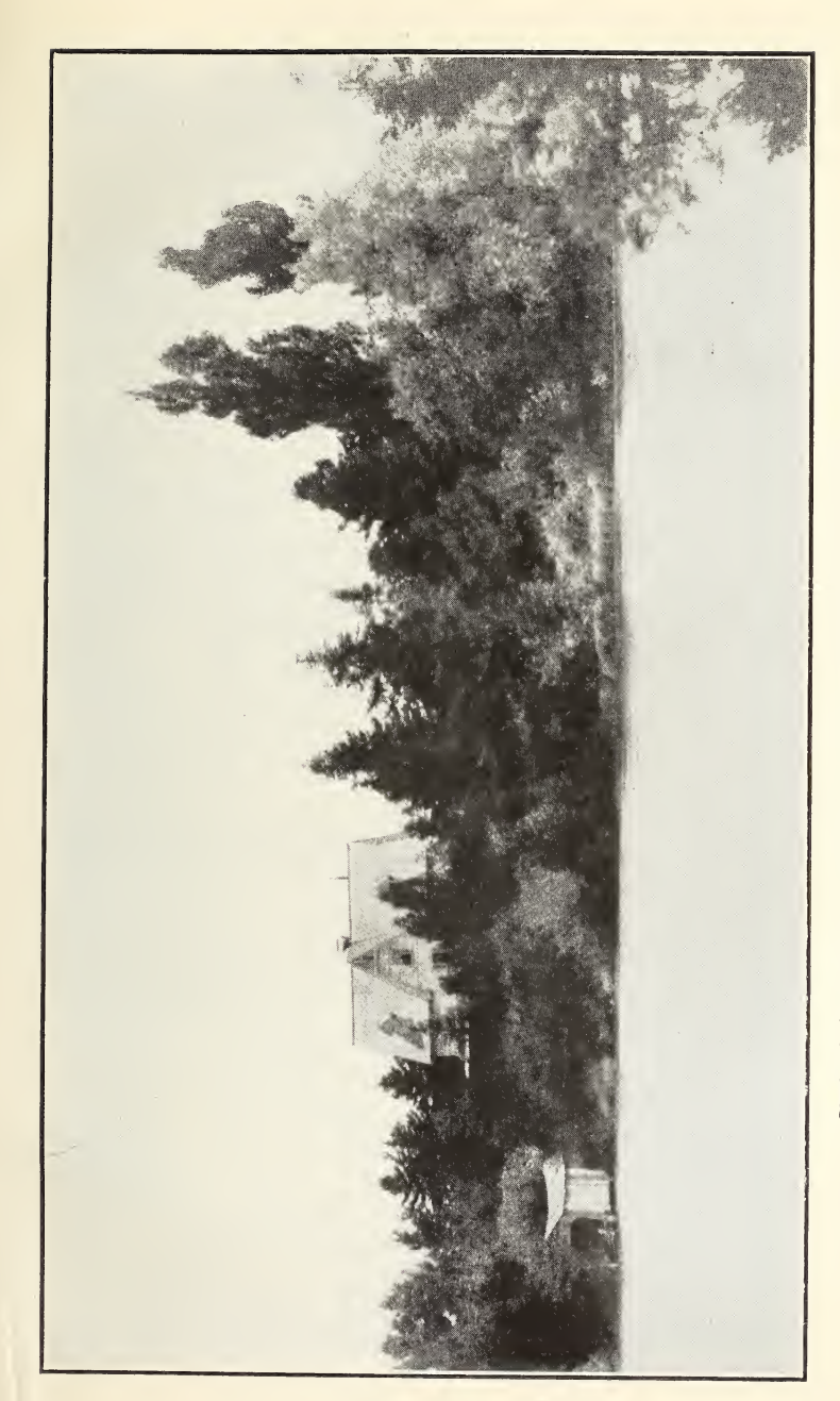
"Glenlonely," the home of Quetton St. George, at Oak Ridges, showing lake and boathouse.