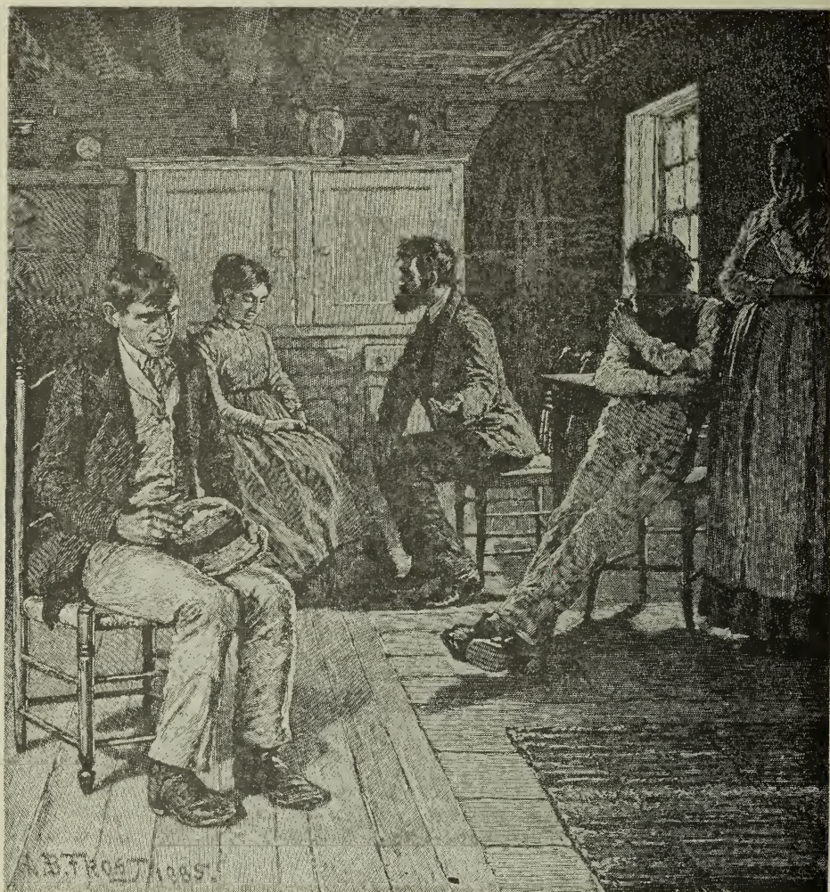
COURTING BY PROXY