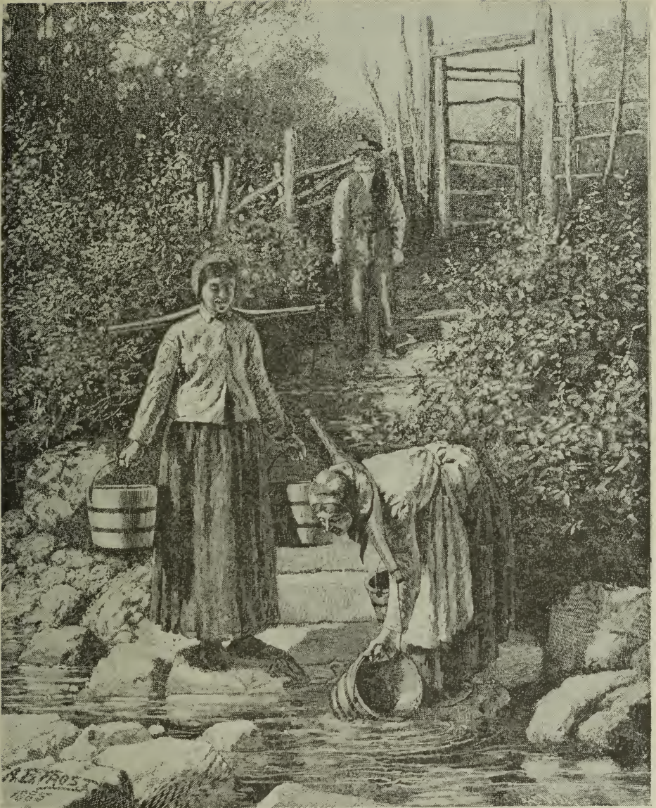
AT THE WELL

one of the most liberal-minded of the ministers, "We find no countenance given to it in the Bible, either by precept or example, and we are very much of the opinion that it is of popish, if not of heathen, origin."