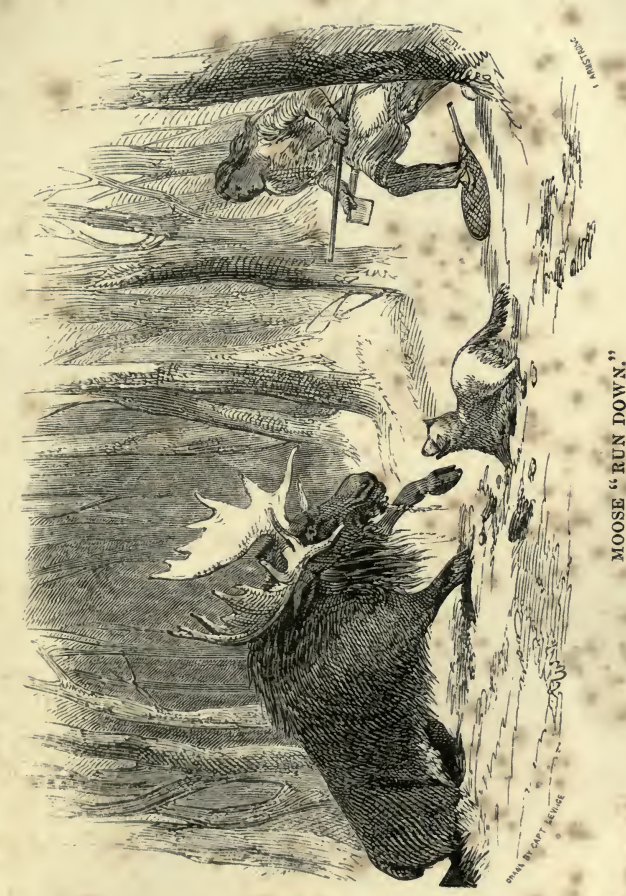
MOOSE "RUN DOWN."