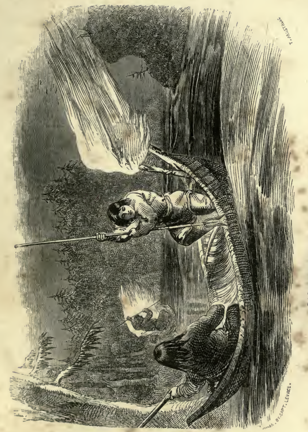
SALMON-SPEARING BY TORCHLIGHT.