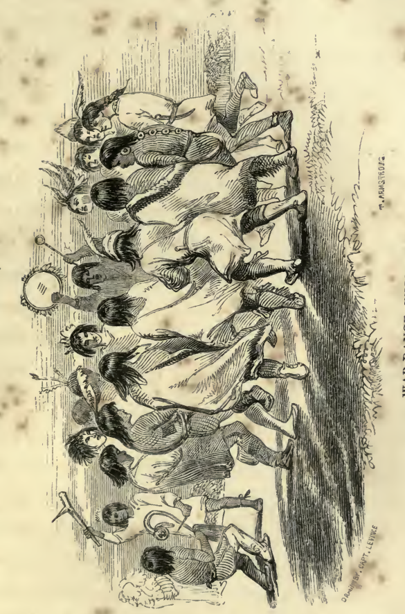
WAR DANCE, WISCONSIN.