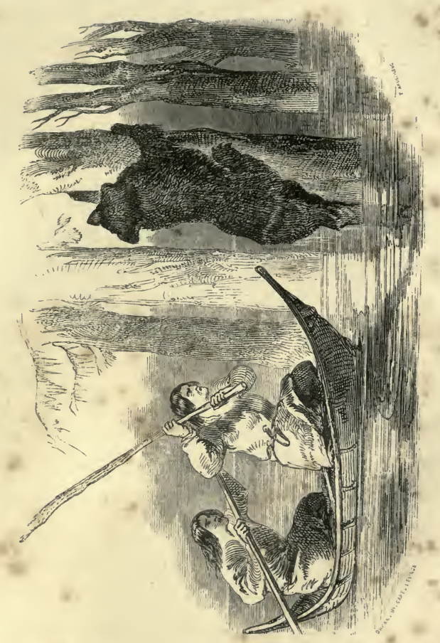
"TREEING" A BEAR.