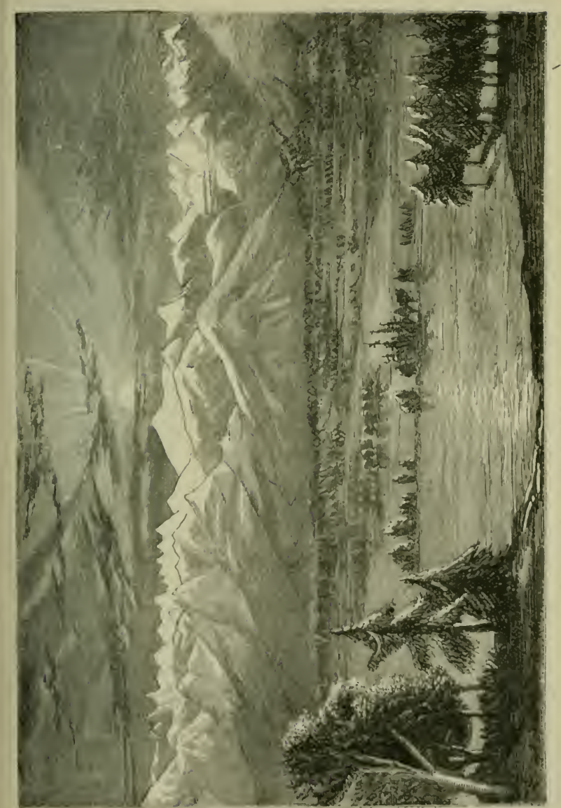
THE R CEY MOUNTAINS AT THE SOURCES OF THE SAFEATCHEWAN.