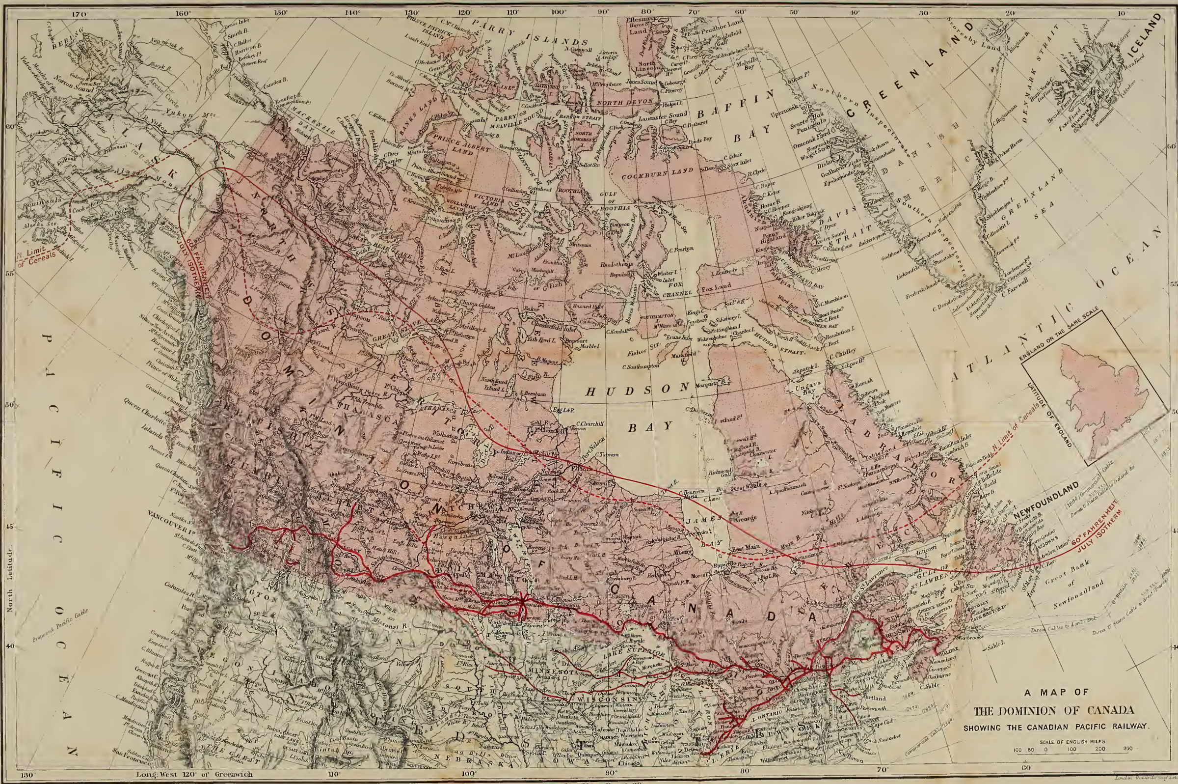
A MAP OF THE DOMINION OF CANADA SHOWING THE CANADIAN PACIFIC RAILWAY.

SCALE OF ENGLISH MILES 100 50 0 100 200 300 60