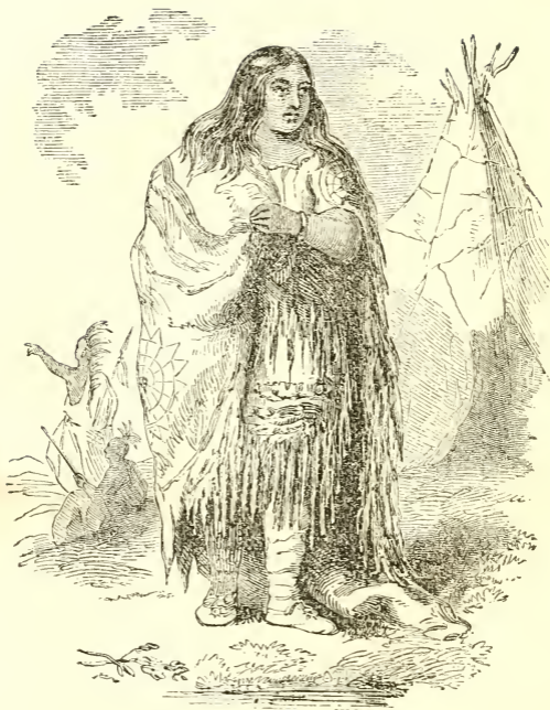
AN INDIAN WOMAN IN FULL DRESS.