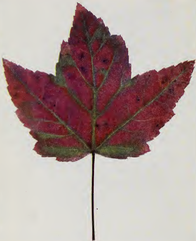
HARD MAPLE LEAF