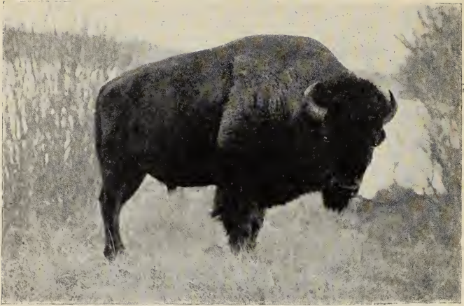
The Buffalo Park, Wainwright