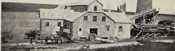
Fraser Lumber Co., Fredericton, N.B.