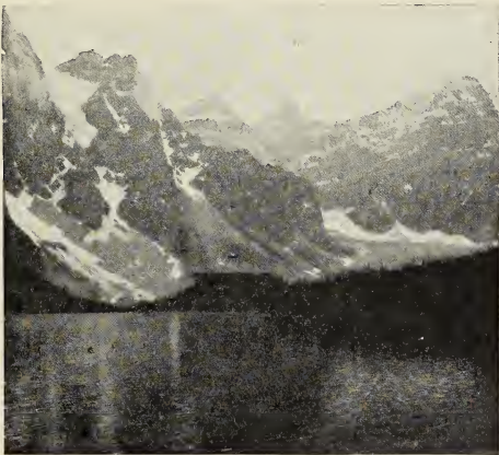
Canadian Pacific Railways

It goes on through the great woods and past the little farms. It goes up the long rivers and past the great lakes. It goes on and on over the wide prairies where the big wheat fields are. Then it crosses the beautiful mountains to the sea in the far west.