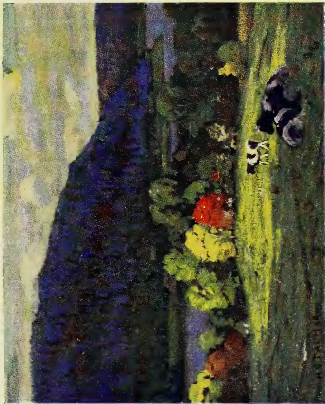
AN ONTARIO FARM.