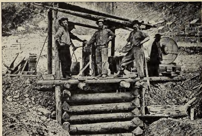
Gold Miners