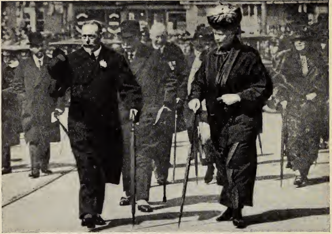
Topical Press Agency