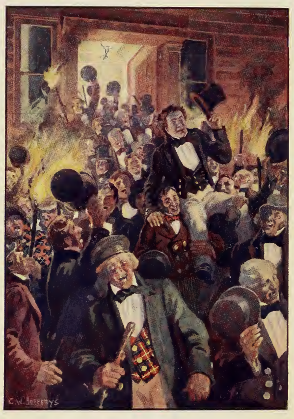
THE TRIBUNE OF NOVA SCOTIA—AFTER A SPEECH IN MASON HALL