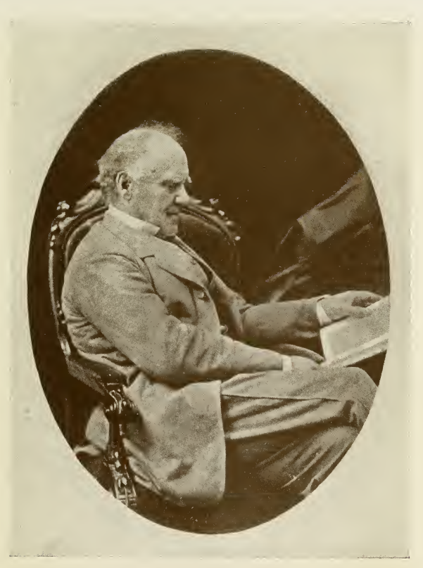
JOSEPH HOWE