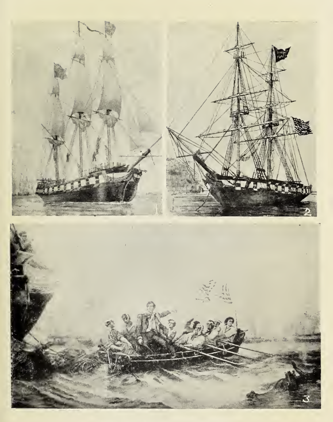
THE BATTLE OF LAKE ERIE

(1) BARCLAY'S FLAGSHIP, THE DETROIT (2) PERRY'S FLAGSHIP, THE NIAGARA (3) THE PASSAGE FROM THE LAWRENCE TO THE NIAGARA