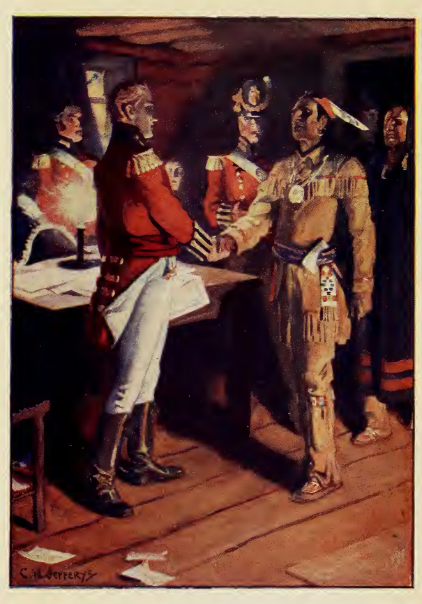
THE MEETING OF BROCK AND TECUMSEH From a colour drawing by C. W. Jefferys