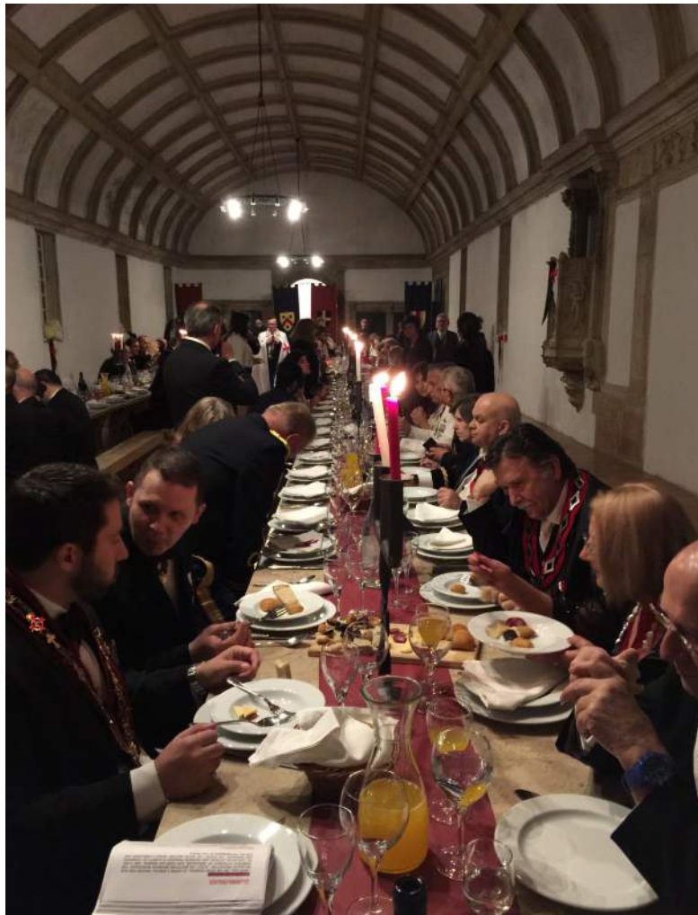
Saturday evening Gala Dinner in Tomar Castle

You can request the Annual Submissions document from the Chancellor if you are interested, and see any meeting documents on the Members Section of www.osmth.org In order to view the member's section, please let the Grand Prior know and a password will be generated for you. This is a resource area open to all knights, dames and novices in good standing, not just your representatives to the various OSMTH meetings.