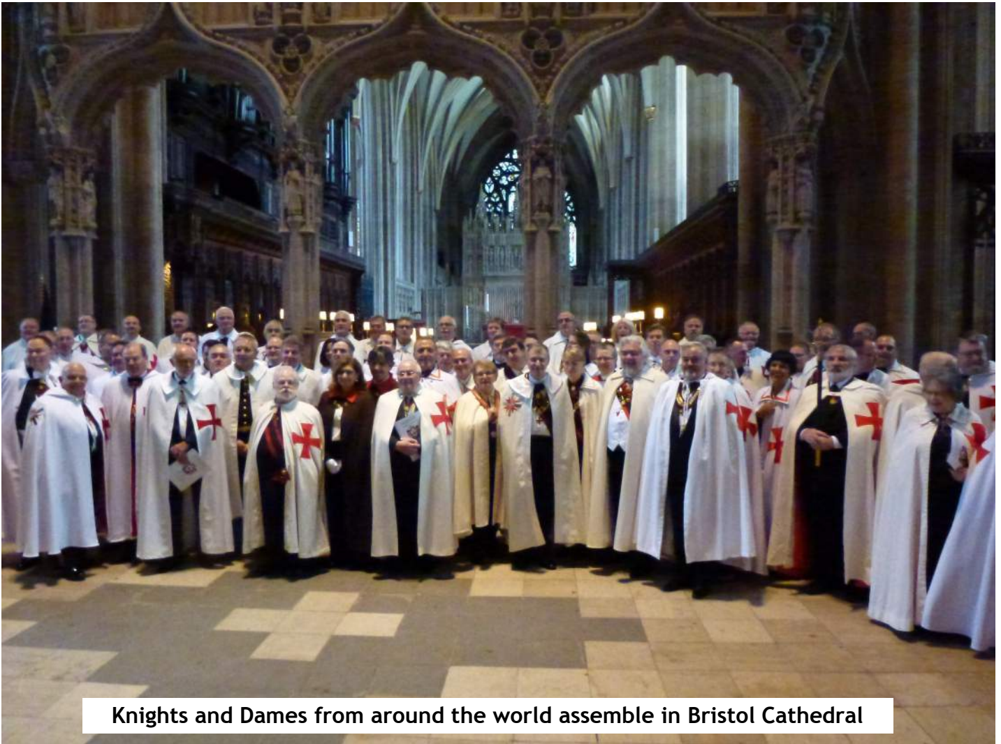
Knights and Dames from around the world assemble in Bristol Cathedral

The Bristol Grand Convent General was sandwiched between several sessions of the Grand Magistral Council.