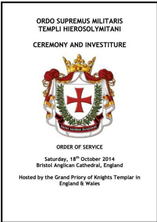
Cathedral Service book (left)