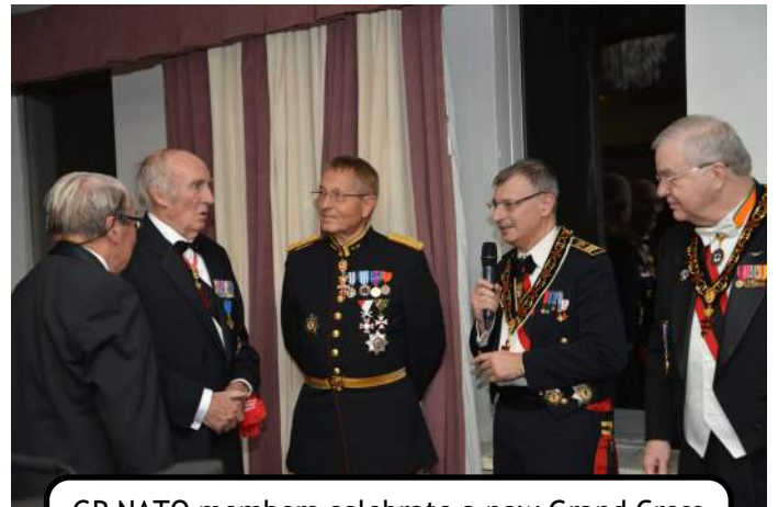
GP NATO members celebrate a new Grand Cross for the Priory of NATO-UK with the Grand Commander and Grand Master