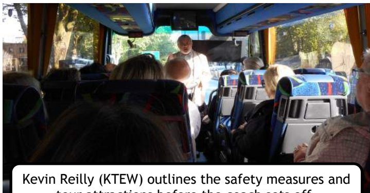
Kevin Reilly (KTEW) outlines the safety measures and tour attractions before the coach sets off.

No significant mishaps, one lost person, lots of happy Italian shoppers and a few sore feet to boot, but all in all, a very pleasant two days was had by all!