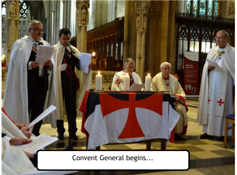
Convent General begins...

Three coaches of Templars arrived in good time to robe in the Chapter Room, a magnificent room in itself under the cathedral before assembling in rank to parade into the nave and take their seats. We were honoured to have local members of the Grand Priory of NATO, NATO-UK