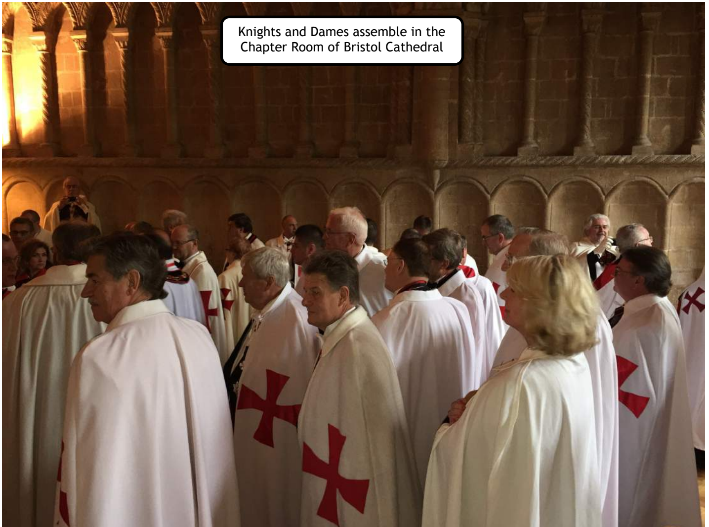
Knights and Dames assemble in the Chapter Room of Bristol Cathedral