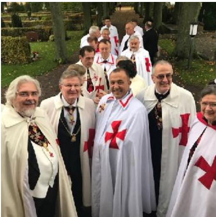
The Grand Priors lining up in Sweden as they prepare to enter the Billeberga Church

places where terrorism, violence, warfare and acts of inhumanity are taking place. Guard, protect, direct and gather us into one great family; that we may worship you in peace and live together in Holy love, through Jesus Christ our Lord. AMEN