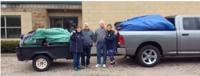
A pick-up run of donations in Toronto heading for Ottawa and on to the far north

Hockey Knights in Canada continues with over two tonnes (16 pallets) of hockey equipment off to the area of Inuvik.