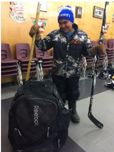
for future hockey champions like this recipient

Funding the transport came from a night of "Trivial Pursuit" at the Prior's home raised almost $2000.00