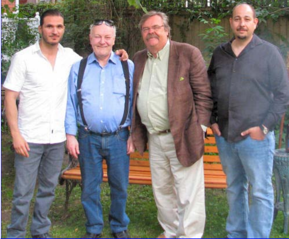
And even your editor got into a shot!