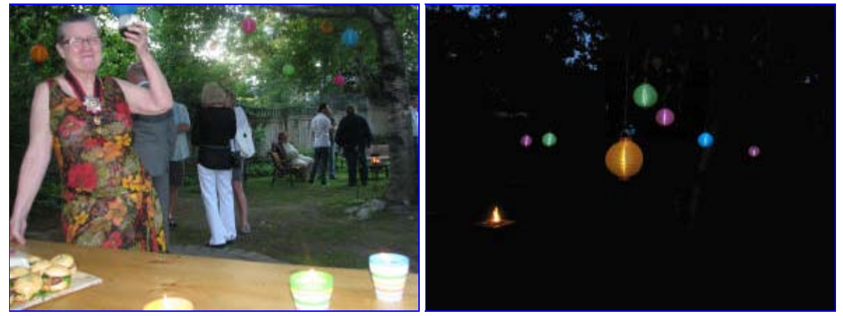
Our Grand Chancellor and lights and fire pit in the evening as it got dark