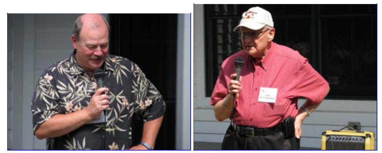
Our Grand Prior and Vicar General tell us what is happening in Canada and around the world

I was not confident that video would work but took a couple of small ones and to my surprise they actually came out not too bad at all and I now wish I'd done more.