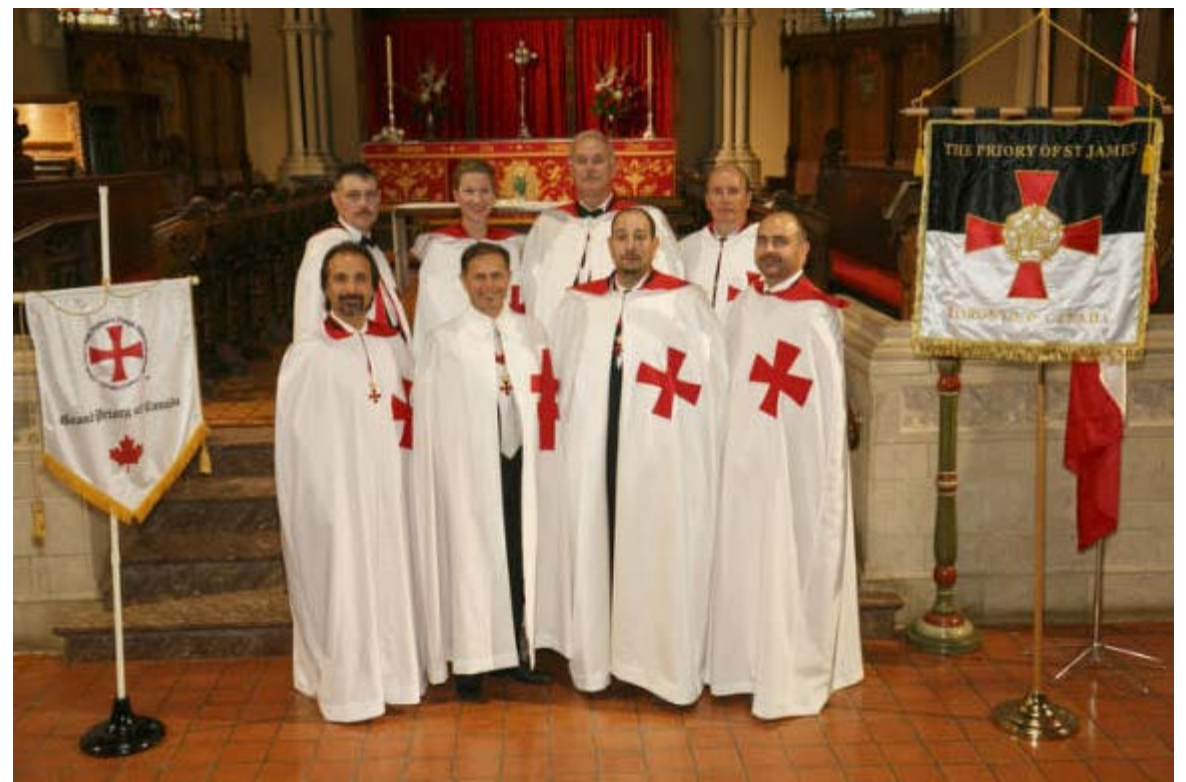
Our new Knights and Dame