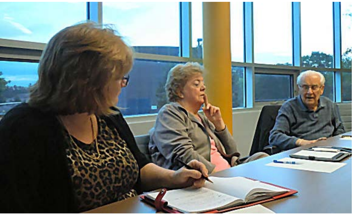
Members of our Priory Council hard at work at a Council meeting