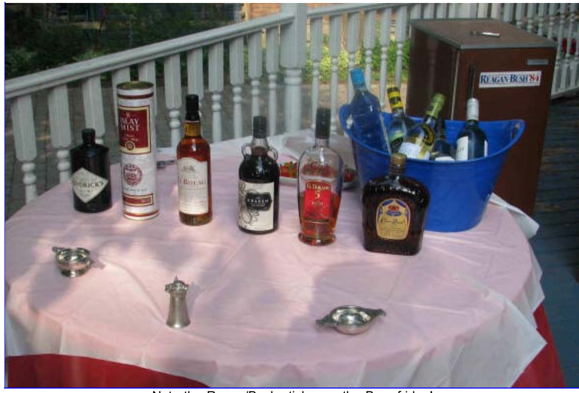
Note the Regan/Bush sticker on the Beer fridge!