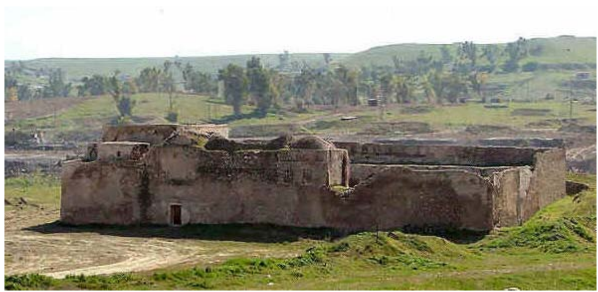
The abandoned Saint Elijah's Monastery — the oldest Christian monastery in Iraq — located in the Nineveh Province, just south of the city of Mosul.

But the latest round of violence spearheaded by the jihadist terrorist group Islamic State of Iraq and Greater Syria (ISIS), which is driving through the heart of Iraq to the capital of Baghdad and inflicting medieval-style Islamic justice on anyone in its path, might be the last gasp of Iraq's ancient Christian community, which faces extinction like Iraq's Jewish community before it.