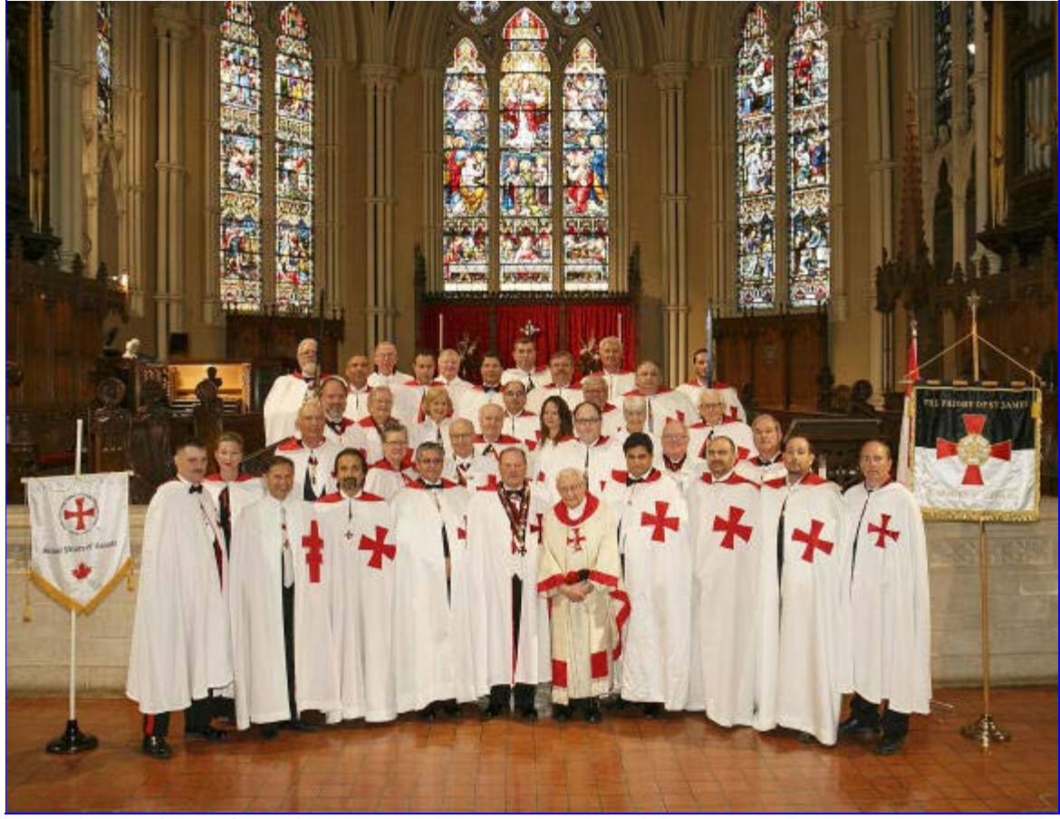
Group Shot (Clicking on the picture will bring up a much larger version)