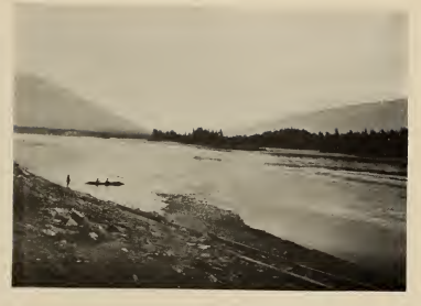
Columbia River, Revelstoke

Mount Begbie and Columbia River, Revelstoke