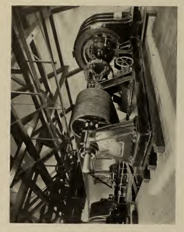
850 I.H.P. Three Phase Electric Motor Driving Corliss 40 Drill Compressor Nickel Plate Mine, Rossland