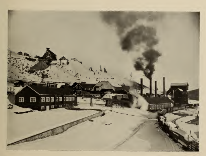
The Black Bear Works of the Le Roi Mine, Rossland