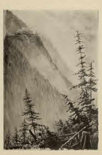
Cave Falls, Crow's Nest Pass