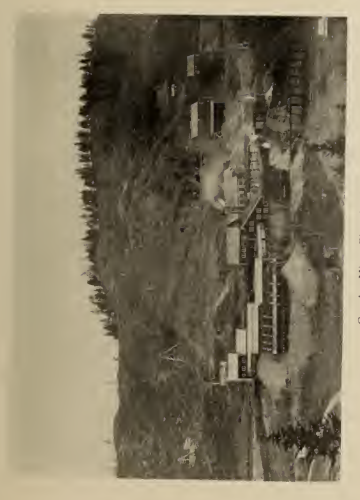
Granby Mine, Phoenix, B.C.