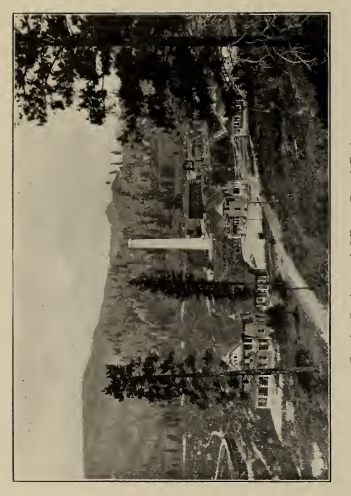
Granby Smelter and Offices, Grand Forks