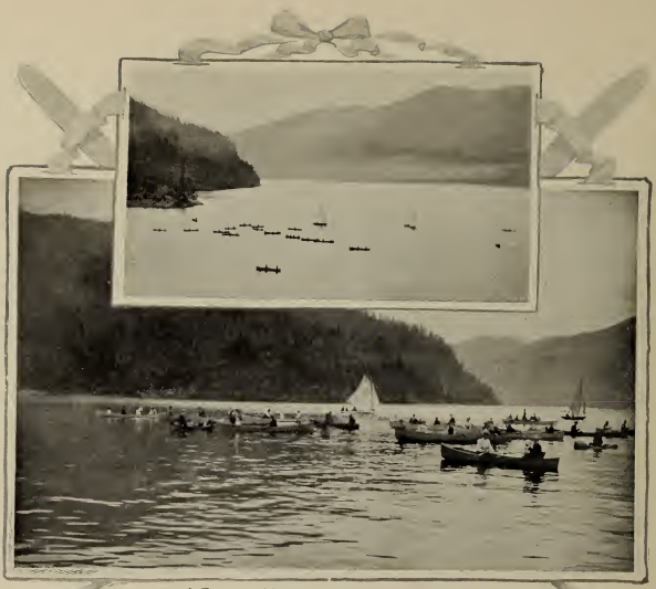
A Frequent Afternoon Boating Scene at Kaslo