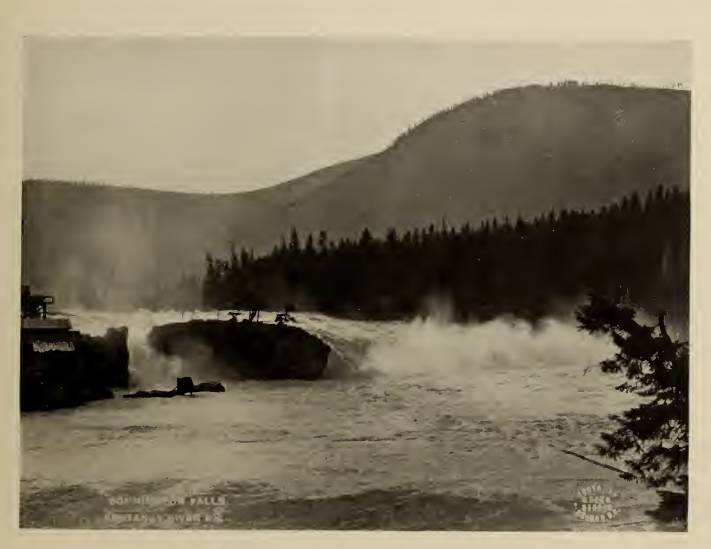
Bonnington Falls, Kootenay River, near Nelson