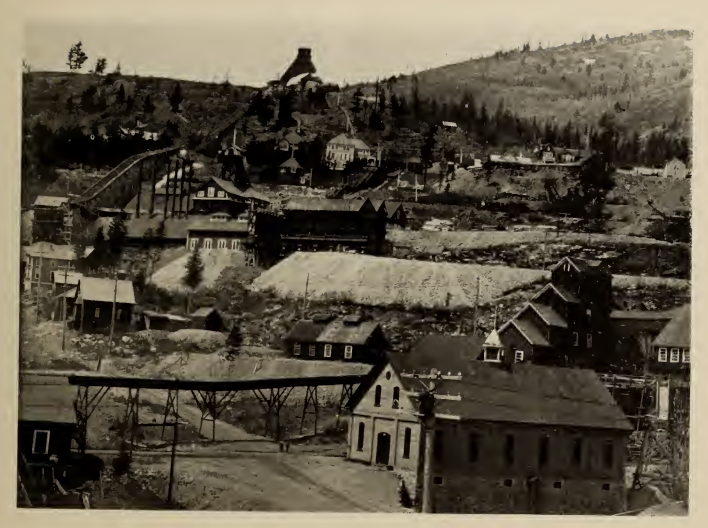
War Eagle Mine, Rossland