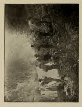
Packing Scene, showing Prospectors starting out from Camp with Packs on their Backs