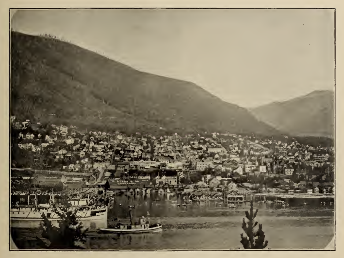
Nelson, from across the Kootenay River