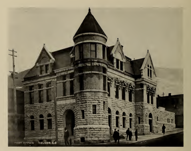
The New Post Office, Nelson