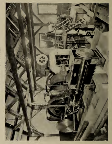
Hoisting Engines, Le Roi Mine