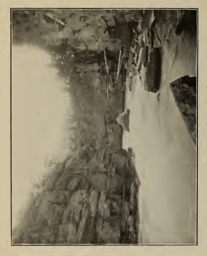
Elk River Canon, Crow's Nest Pass