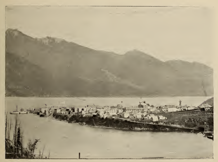
Kaslo City from the Northwest