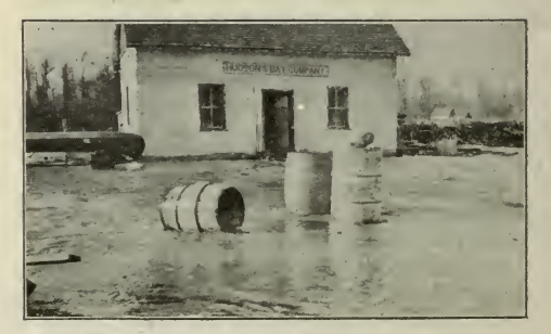
The Swirling Waters in Front of the Store.

Very soon the water was making a noise like a waterfall and sweeping everything before it. In a short time the sidewalk was trying to pilot its way through the garden gate. A cord of wood made an effort to follow suit