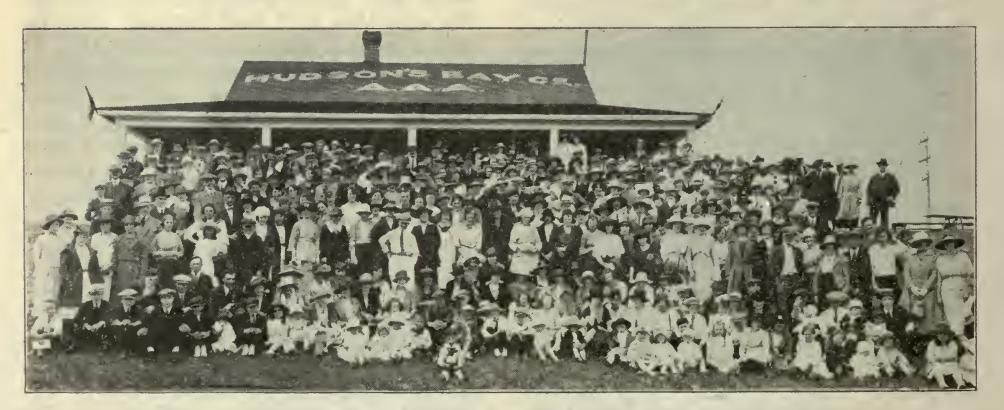
The Happy Throng at H.B.C. Field Day, Calgary, June 8th, 1921

Music was supplied by an all-star band during the afternoon, and the comedy police proved an added feature in patrolling the grounds during the day. They made several amusing ar-