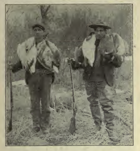
CHIPEWYAN Indians returned to H.B.C. Post with a fine bag of the great grey geese that flock in thousands over Lake Athabasca.

many of these rivers and places of note are named after my friends or after the rivers in my native glens.