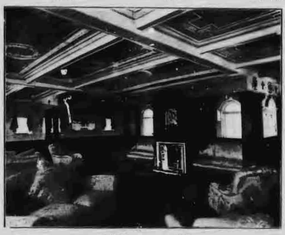
S.S. VIRGINIAN-MUSIC ROOM

It should be remembered that at that time the Intercolonial Railway had not been undertaken, and so there was no railway between the Maritime Provinces and the west. Montreal was the summer terminus on this side, but there had to be as well a winter terminus in order to