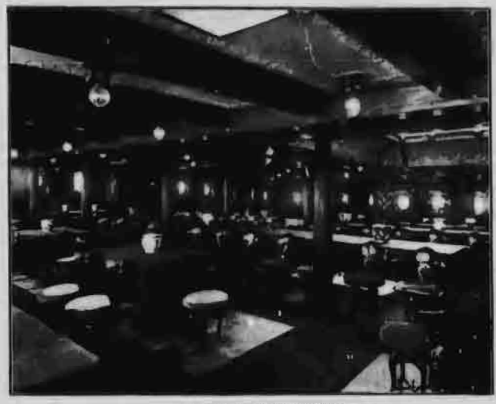
8.8. VIRGINIAN-DINING SALOUN

provide an unbroken yearly service. The Grand Trunk Railway was completed to Portland that very year, 1853, and therefore Portland Lecame the winter terminus of the new steamship line. However, the Intercolonial was yet to come as a condition of Confederation. It was completed in 1876, connecting Quebec with Halifax, which thereafter became the winter port of the Allan Line of Royal Mail Steamships. Six years later the fortnightly service was increased to a weekly service, which has been continued ever since.