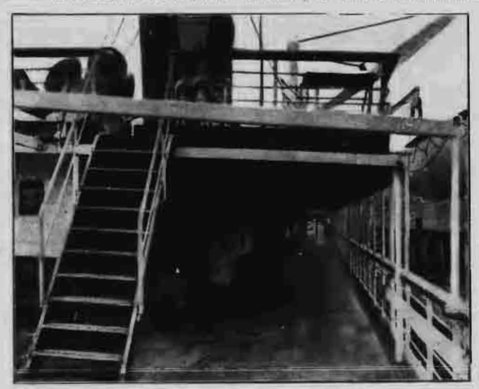
PROMENADE DECK-ALLAN TURBINE STEAMSHIPS

rate of twenty-two knots an hour. To the inexperienced mind that appears to be tremendously out of proportion. If it takes, say, 250 tons of coal a day to run one of the Allan turbine steamers at an average speed of seventeen knots an hour, the difference between the cost of running a vessel of that type and one of the large Cunarders of a speed of twenty-five knots would be readily appreciated, especially when it is considered that the latter will consume four or five times as much coal. But coal is not the only thing. There are as well the men to handle it, the space to put it in, and the men also to run the extra large engines. Fach of the Allan turbine steamships employs a crew of 350, while a crew of one of the large Cunarders numbers well up towards 1,200. The Allan turbiner Victorian or Virginian is well equipped with a crew of 350. So large an army of men as 1,200 working in the lower portions of a vessel at sea is a thing of tremendous significance, and it might well be regarded as a real menace rather