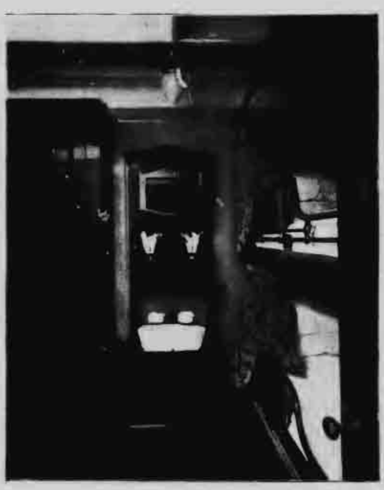
TYPE OF FIRST-CABIN STATEROOM IN ALLAN TURBING STEAMSHIPS

is, What is the maximum of size and speed in keeping with profitable operation? That question seems to apply with particular fitness here in Canada. We hear a great deal of talk about a fast mail service, about short routes, and about summer and winter ports, but it is doubtful whether the general public. and even many of those who do a good deal of the talking, really appreciate the meaning of what they presume to discuss. While this article is not intended to be a technical consideration of the economic of shipbuilding and ship operating, there is at the same time a hope that it may serve to give some idea of what a great and involved problem a serious consideration of the ocean transportation question really is. According to conditions in Canada, two