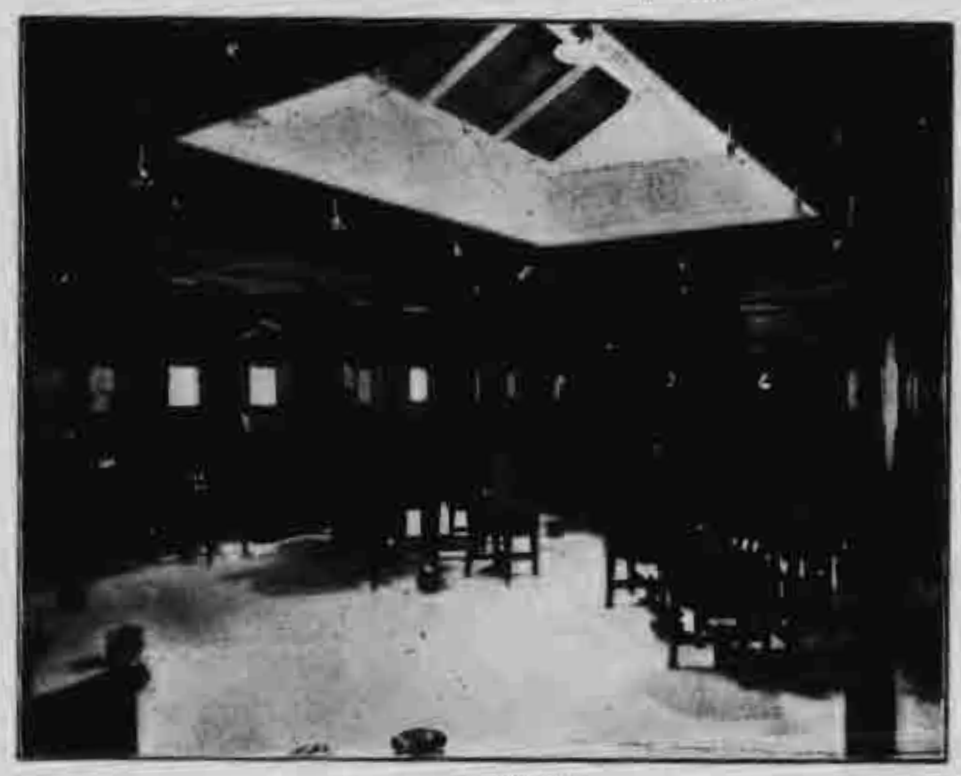
S.S VICTORIAN-SMOKING ROOM

modation was even just a decade ago. There has been good reason for these changes. Canada, within the last ten years at least, has enjoyed a tremendous impetus, and travellers and tourists of all manner and means are coming this way, and in increasing numbers, by the routes. Travellers direct steamship have come know that accommodation on the best Canadian steamships is first class, and Canadians themselves have at last come to be not afmid of being regarded as a little provincial if they patronise home industry on the great seas. Trade with Great Britain has also advanced with enormous strides, and therefore the steamship companies have felt warranted in providing a service that would compare with the best anywhere. There are two advantages to Canada-shortness of route and natural beauty of scenery along the St. Lawrence River from the Gulf to Montreal. These two things, shortness of route and beauty of scenery, are really of great importance. Of all the persons who travel, almost