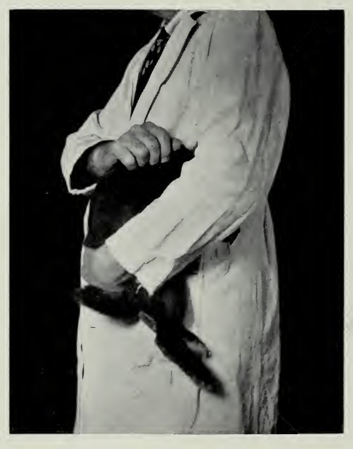
A\ large\ rabbit\ can\ be\ carried\ comfortably\ if\ held\ as\ illustrated.