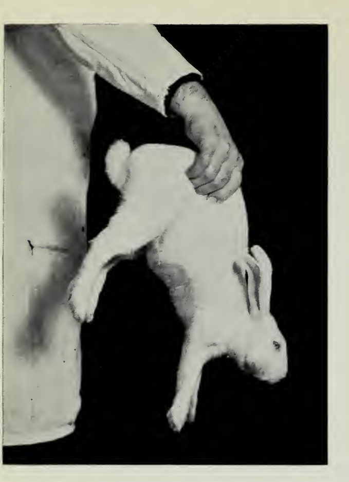
Young rabbits can be lifted by the flank without causing injury or pain.