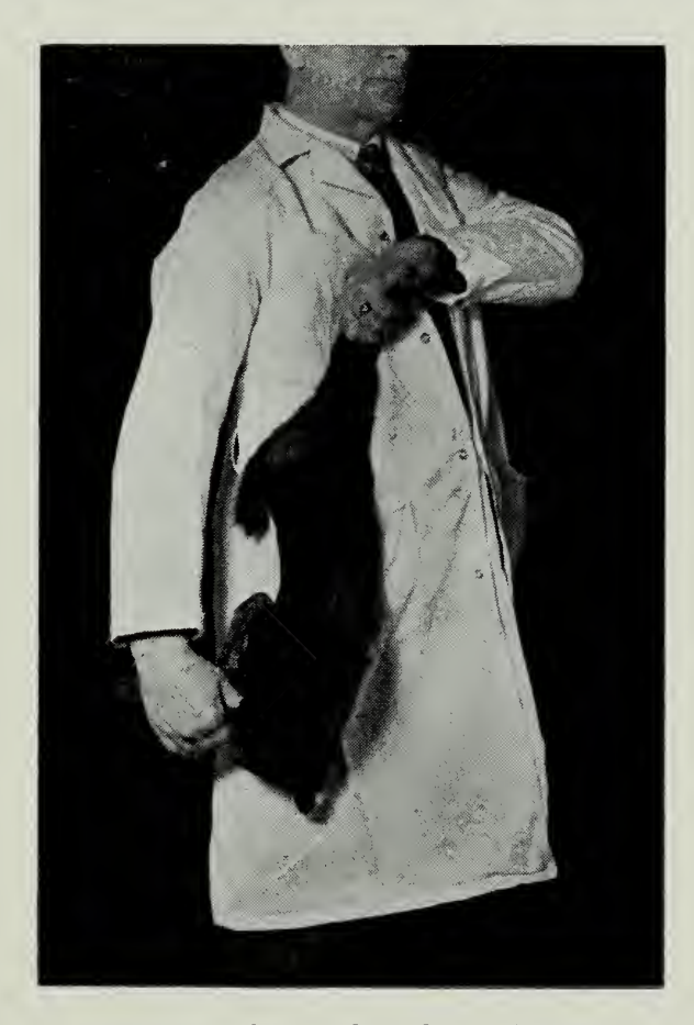
Dislocating the vertebrae before bleeding.

When the pelt is off, the carcass should be rinsed in cold, clean water to remove any blood or hair. The rinsing process is quickly done. The carcass is then hung up and the viscera removed. The heart, liver and kidneys are good food and should be saved. When the carcass has cooled out, it can be cut up into sections of a size suitable to the roasting pan. Rabbit carcasses that are intended for the market should be cut into eight pieces, placed in a suitable wax-paper-lined (9" x 4" x 2\frac{1}{2} ") box or on a cardboard picnic plate, and then wrapped in cellophane for protection. Such wrapping can be made very attractive; a sprig of parsley or other green leaf adds to the appearance, and will help make sales to prospective customers who have not yet learned to appreciate rabbit meat. Do not expose the entire rabbit carcass for sale. They are unattractive to most people and unsaleable. Cut up the carcass ready for the pan and display in an attractive manner if you desire quick sale.