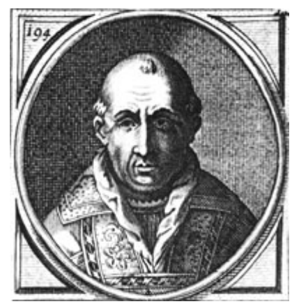
Pope Clement V

"...a good deal of material about the Templars remains. The Order is far from being a mystery." "Other myths about the Templars abound, It is not true, for example, that the Templers were found guilty as charged in 1312; Pope Clement V actually declared the charges not proven, but dissolved the Order because it had been brought into so much disrepute that it could not continue to operate. The Templers were not monks...." [p. 12.]