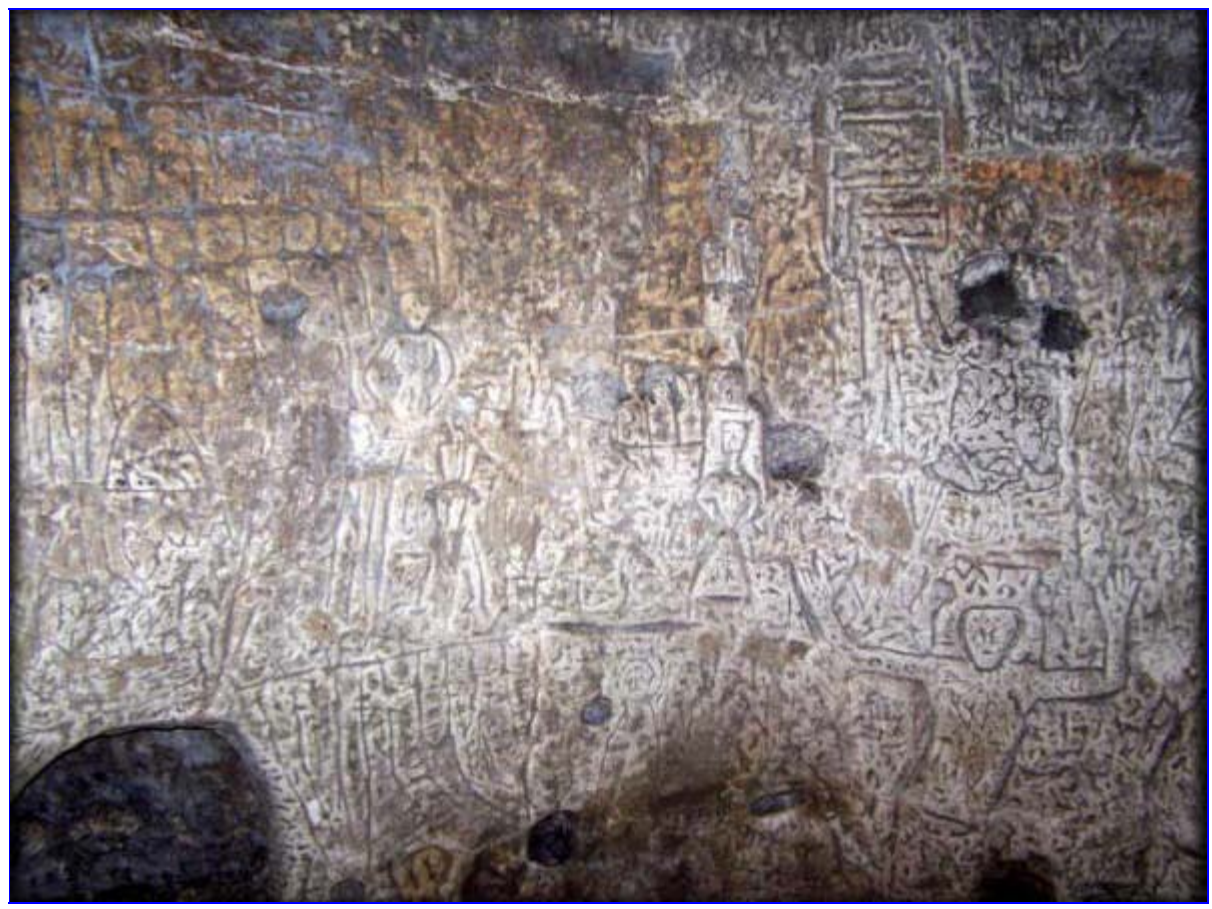
Knights being burnt at the stake See <a href="http://www.roystoncave.co.uk/index.html">http://www.roystoncave.co.uk/index.html</a>

disappearing before their meaning is solved. Having survived 700 years, the symbols in the ancient cave at Royston, Hertfordshire, are under attack by worms eating the chalk walls behind them. The chamber was shaped out of a 180ft-thick seam of chalk and extends 30ft beneath the centre of the market town. It was discovered in 1742 and the depictions of biblical scenes and portraits of Christian martyrs inside it have confused historians ever since. (guardian.co.uk)