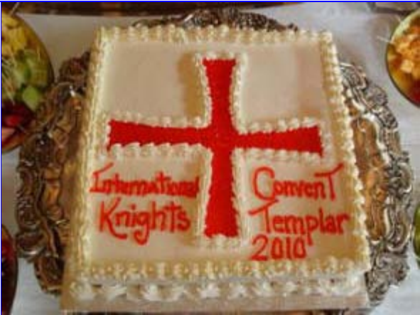
A great time was had on the Niagara Falls Trip