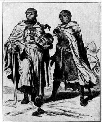
Knights of Livonia, or Sword-Bearers