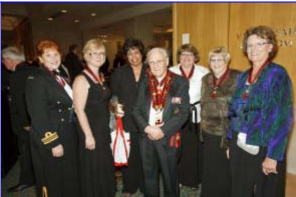
The Blessing and the Grand Prior of Canada's Fan Club