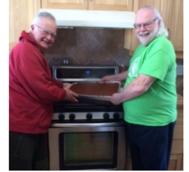
The finished product was so heavy that it took two to lift it from the oven