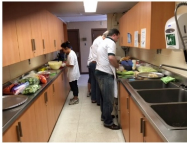
Preparing and serving lunch for the Aphasia Walk 'n' Talk

The Aphasia Centre of Ottawa is planning a Trivia Night fundraiser in the fall and of course the Simon Peter trivia team, the "Retro-Rockets" will field a team. While never the Team to Beat, we are always contenders. We may have mentioned our annual lunch served to victims of strokes which we call their "Walk 'n Talk". Stroke victims frequently have limited use of at least one arm and leg. This combined with the prevalent loss of speech prompted the name of this social event.