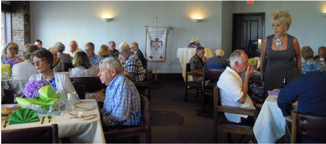
Some of the 36 attendees