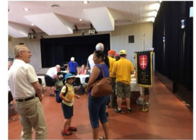
Serving lunch for the Aphasia Walk 'n' Talk

The Aphasia Centre of Ottawa is planning a Trivia Night fundraiser in the fall and of course the Simon Peter trivia team, the "Retro-Rockets" will field a team. While never the Team to Beat, we are always contenders. We may have mentioned our annual lunch served to victims of strokes which we call their "Walk 'n Talk". Stroke victims frequently have limited use of at least one arm and leg. This combined with the prevalent loss of speech prompted the name of this social event.