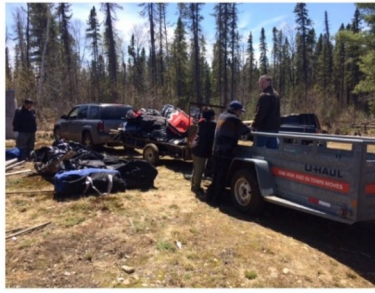
Dropping hockey equipment off at Barrier Lake