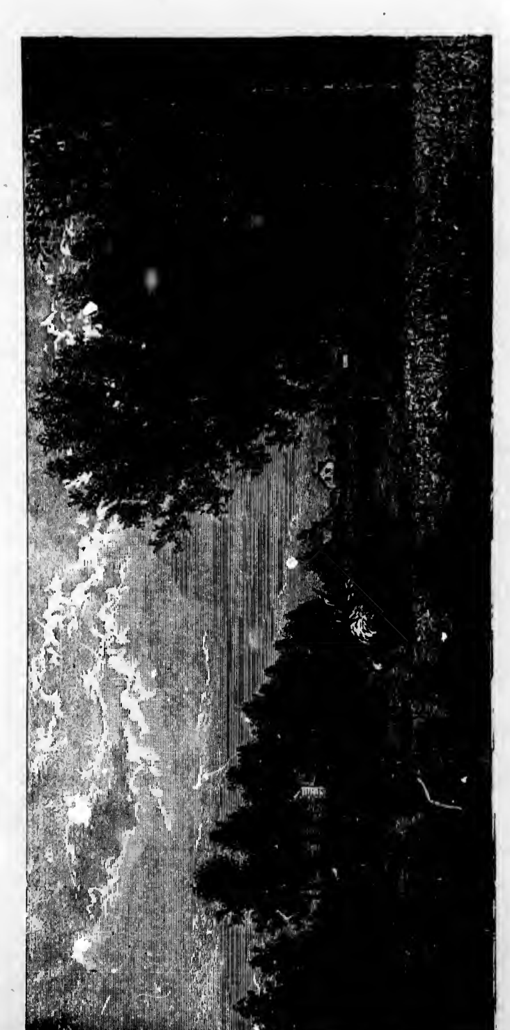
HOMESTEAD FARM AT KILDONAN, NEAR WINNIPEG. - Engraved from a Photograph.