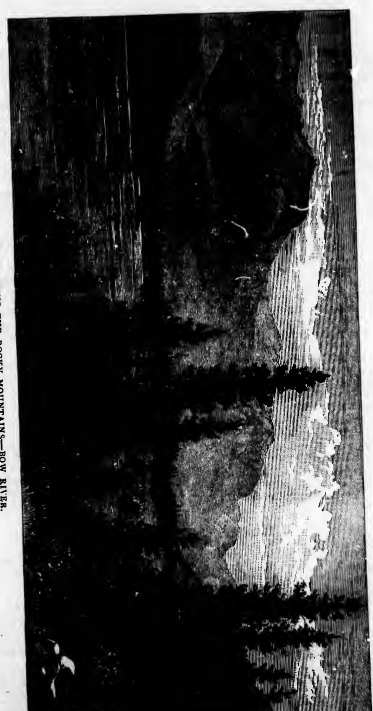
APPROACHING THE ROCKY MOUNTAINS-BOW RIVER.