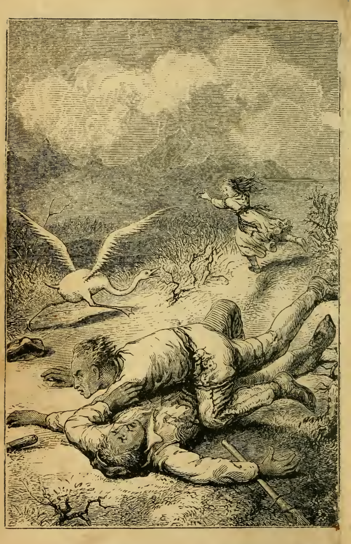
A WILD-GOOSE CHASE.