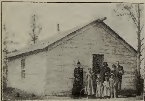
Mission House, Makoce Waste Reserve