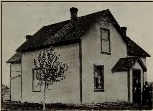
School at Encampment, Prince Albert