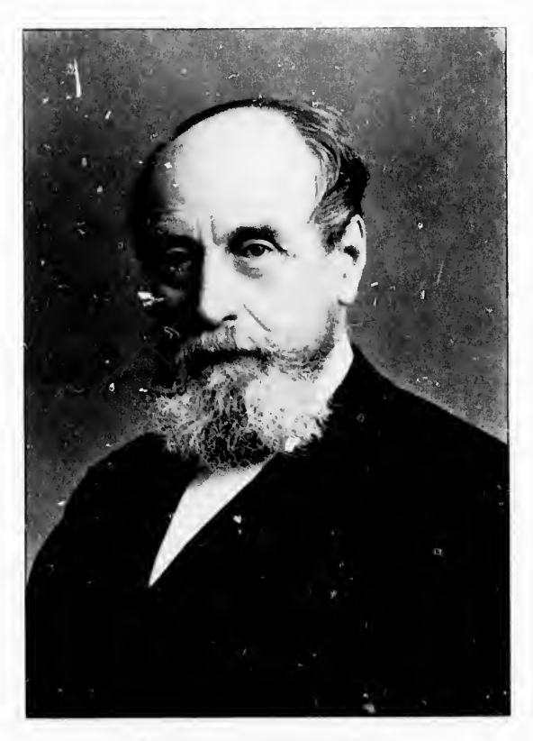
SIR JOHN WILLIAM DAWSON.