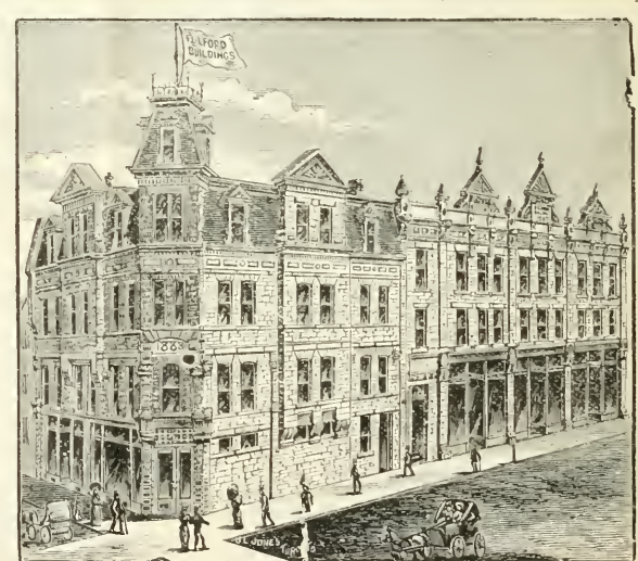
EVILLING OCCUPIED BY FULFORD & CO

The interior of the store has apparently been fitted up regardless of expense. The walls and ceiling were decorated by New York artists, and is known as linspar, and