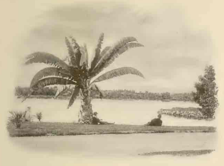
Wintering in California.

The tourist who has determined to pass the winter amid the orange groves and palms of California will have a choice of many routes, all leading to the Golden State; but in baying his round trip ricket, he should consider carefully the advantages offered by the Canadian Pacific Railway as a means of returning home. After he shall have looked into the merits of the competing lines, he will no doubt decide—as thousands have done—to journey eastward by the great scenic road of the Continent.