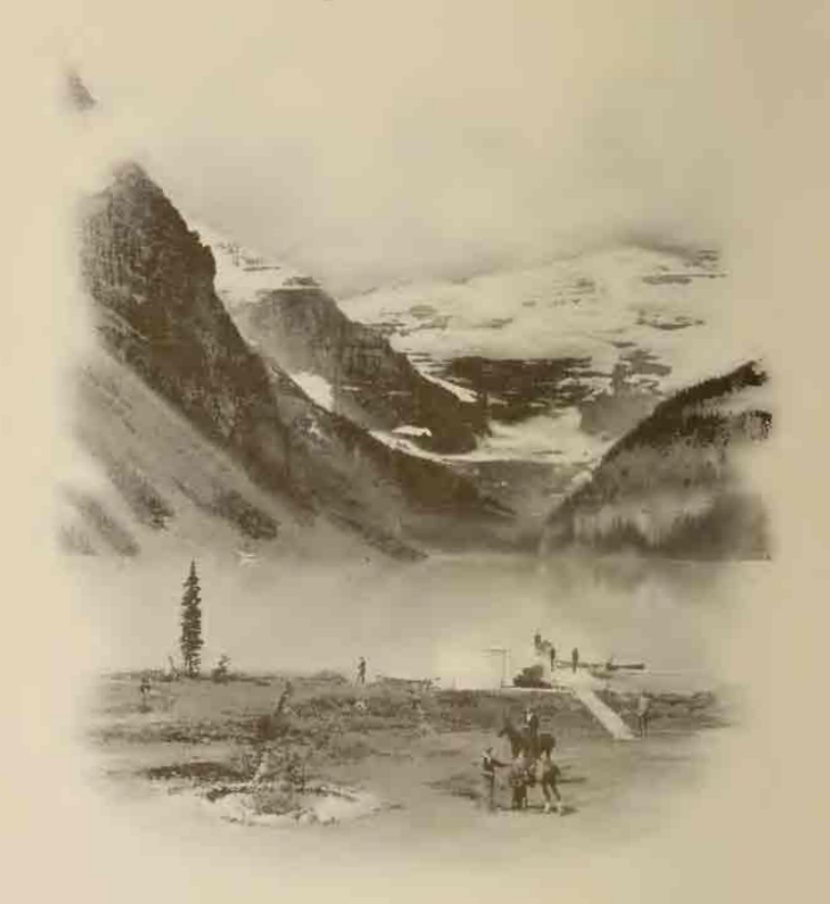
The Lakes in the Clouds - Lake Louise.

The main line of the Canadian Pacific Railway is usually considered as made up of three sections, sharply differentiated by their physical peculiarities. From west to east they are: the mountain region, the prairie country, and the forest lands of Ontario. Two of these have been left behind and the traveller enters upon the remaining third of his journey. After leaving the Red River the prairie disappears, the woods, at first sparse and stunted, increase in Juxuriance before the Manitoba boundary is reached, and henceforth the run is through a land second to none in its timber resources.