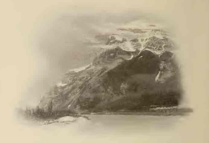
Mount Stephen, Canadian Rockles,

The engineers could only get through these great mountain ranges by following the valleys of the mountain streams, and so in crossing the Rockies the line follows the Kicking Horse to Field, a charming summer resort at the foot of Mount Stephen. The Canadian Pacific Railway châlet hotel at Field is much favored by tourists, as it is the portal to the recently discovered Voho Valley, where are the Takakkaw Falls, dropping