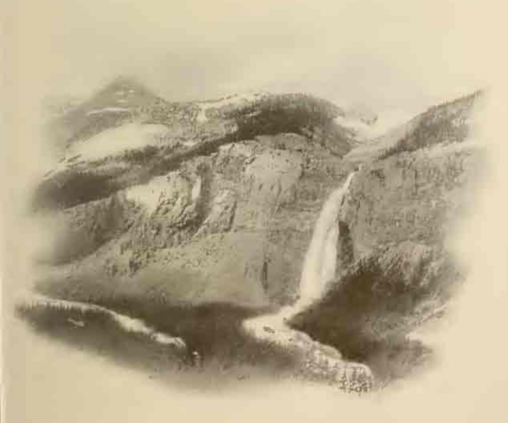
Takakkaw Falls, Yoho Valley.

Winnipeg (population 45,000), on the Red River of the North, is the capital of Manitoba, and contains the greatest workshops of the Canadian Pacific Railway, whose train-yard has nearly fifty miles of sidings. This is