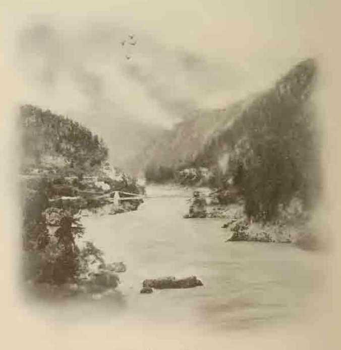
The Frager Canon

There is a daily steamboat service on Puget Sound, between Seattle and Victoria, the capital of British Columbia. The sail is a most delightful one, the steamer's course lying amid islands and over sheltered waters which mirror some of the most magnificent coast scenery of the continent. To visit Victoria is to fall in love with it, and numberless travellers have related how they yielded themselves willing victims to the charms of this picturesque spot. The Provincial Parliament Buildings rank amongst the finest in America, and there is a museum which contains an unusually fine collection of animals, birds and fishes of Canada's most westerly province. Close at hand is Esquimalt, one of the great naval bases of the British fleet. It is strongly fortified, and has a graving dock large enough to hold any of the vessels which constitute the North Pacific Squarkon. Between Victoria and Vancouver, 84 miles distant on the opposite coast of the mainland, there is a daily steamship communication, and the sail is even better from an artistic point of view than the run from Seattle to Victoria. On a fine day the view of the Coast and Cascade Ranges, culminating in Mount Baker, astonishes and delights even those who have revelled in the most famous scenery of the Old World.