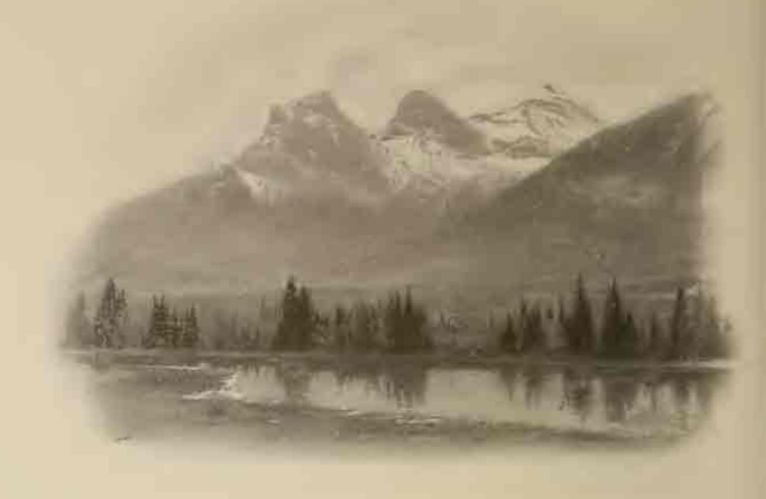
The Three Statets, Canadian Rockles,

For further information as to rates, etc., apply to the nearest Canadian l'acific Railway agent, or to