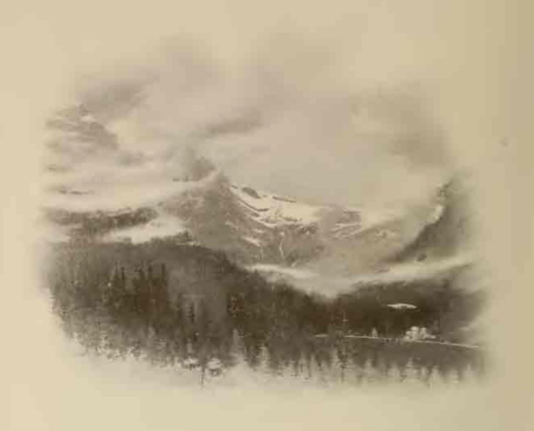
The Great Glacier of the Selkirks.

tled in snow and reflected in the deep, calm waters of the inlet. On English Bay are pleasant summer resorts, and nowhere in the wide world is there a more beautiful natural park than that which the Vancouverites named after Lord Stanley of Preston, when he was Governor-General of the Dominion.