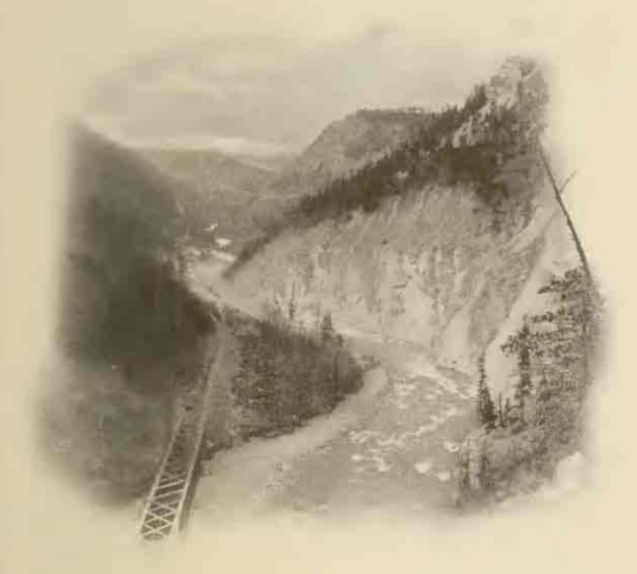
The Kicking Horse Canon.

The finest scenery on the main line is that between Revelstoke and Calgary, a stretch of 260 miles. To rival the majestic landscapes of this region one must visit the Himalayas, for nowhere else in the world is there