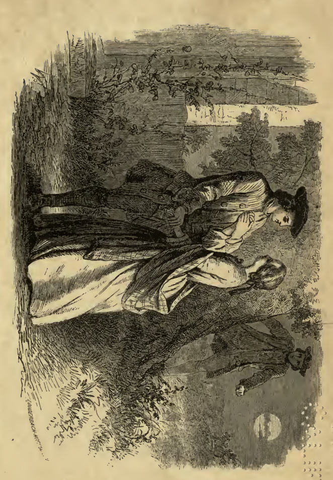
"Good night, my fair Rose, and happy dreams to you."