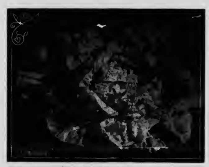
Cabbage headed type

Grand Rapids and Black Seeded Simpson are loose leafed varieties that are hardy. Nonpareil, Big Boston and Hanson are three of the best cabbage-head varieties. Cos-Trianion is one of the best of the celery-like variety. It produces long narrow leaves which, when tied up, bleach to a snowy whiteness and may be used in the same way as celery-