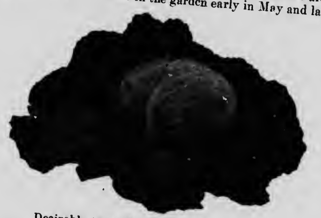
Desirable type of Cabbage for Winter use

Cabbage is one of the best known and most easily grown vegetables. For early use the plants should be started in a hot bed early in April, transplanted to a cold frame when about 2 inches high and finally set out in the garden in rows 30 inches apart and about 18 inches apart in the row, around May 24. For late crops satisfactory results are obtained by sowing the seed in rows in the garden early in May and later thin-