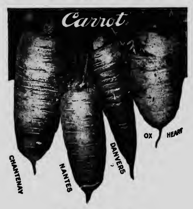
Desirable varieties of Carrots

Carrots are one of the most hardy vegetables. The seed may be sown in the open as soon as the soil warms up in the spring. Sow in deep loamy soil about 1 inch deep in rows 2 feet apart. Thinning need not be done until the carrots are about one quarter inch in diameter,