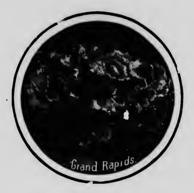
Loose leaf type