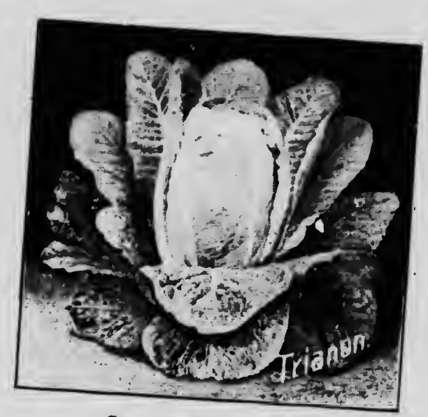
Cos or Celery leaf type