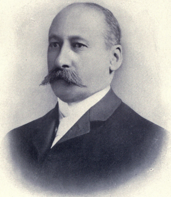
S. S. BOXER.