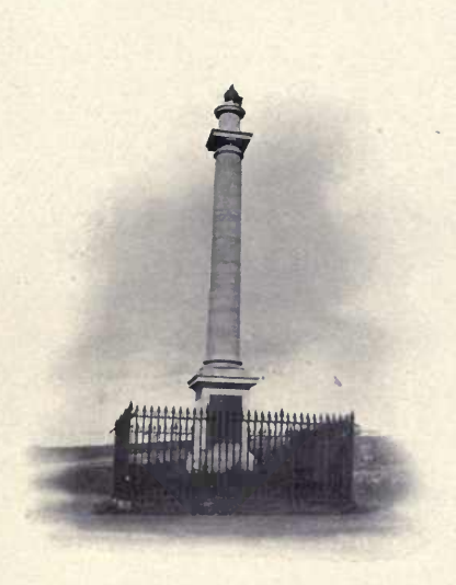
Wolfe's Monument, Quebec.