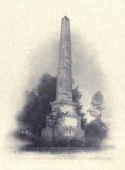
MONUMENT TO WOLFE AND MONTCALM, QUEBEC.