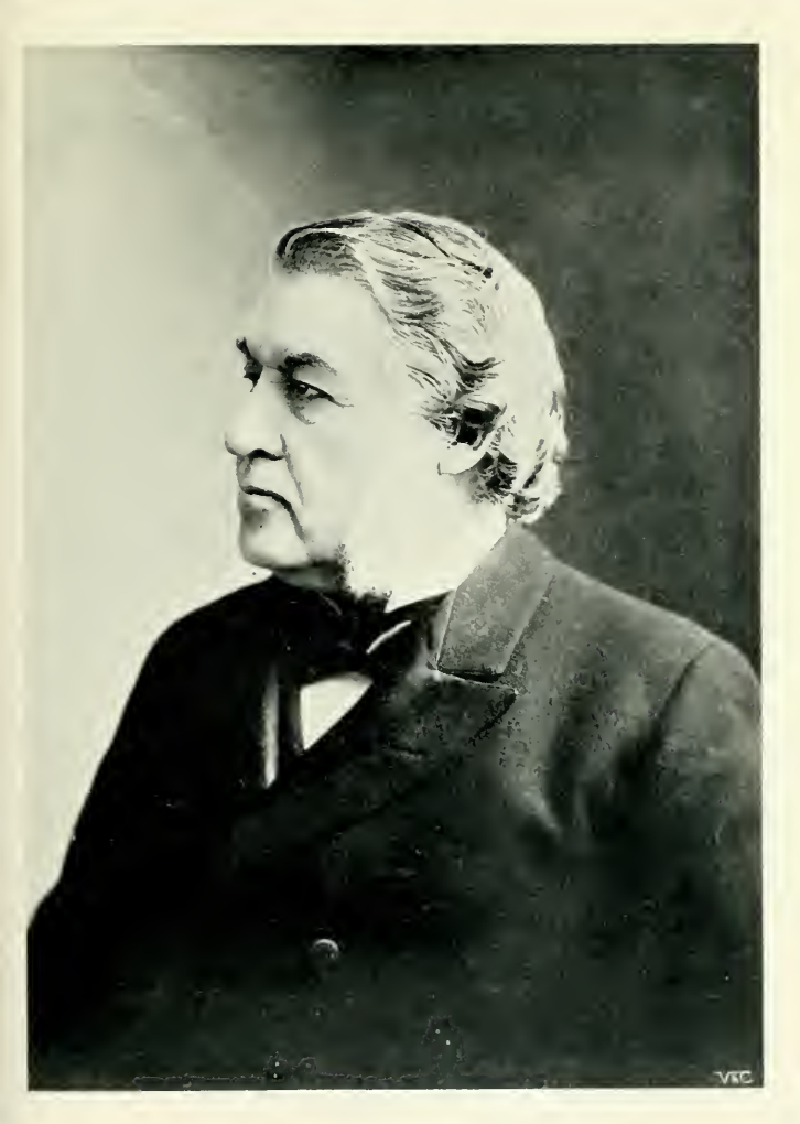
HON. SIR CHARLES TUPPER, BART., G.C.M.G., C.B.