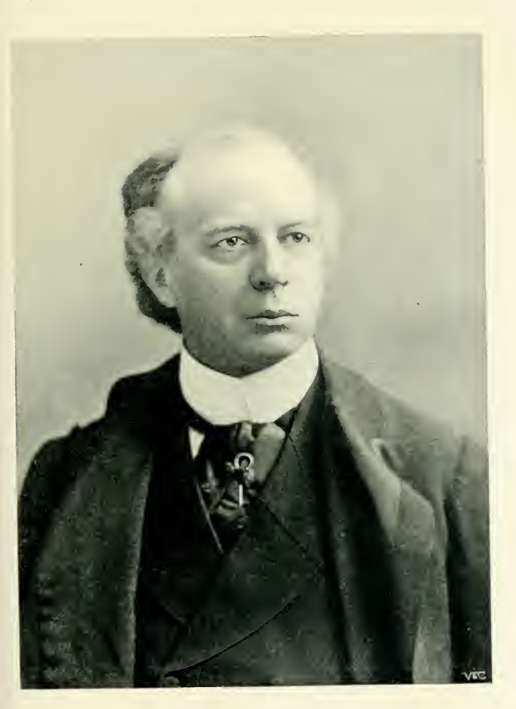
RIGHT HON. SIR WILFRID LAURIER, G.C.M.G.