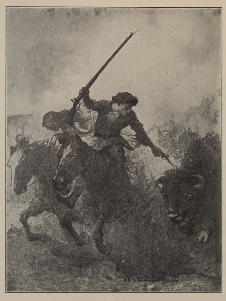
I LEANED OUT AND FIRED STRAIGHT AT A BIG HEAD (p. 105)