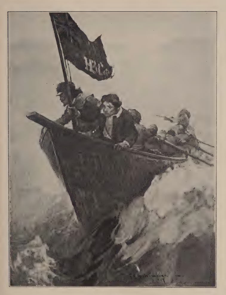
HOW STRANGE IT SEEMED TO ME, A BOY, TO SIT IN THE PROW