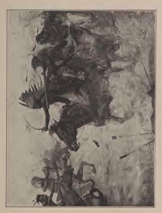
AS THEY SWEPT PAST US THEY SHOT THEIR ARROWS