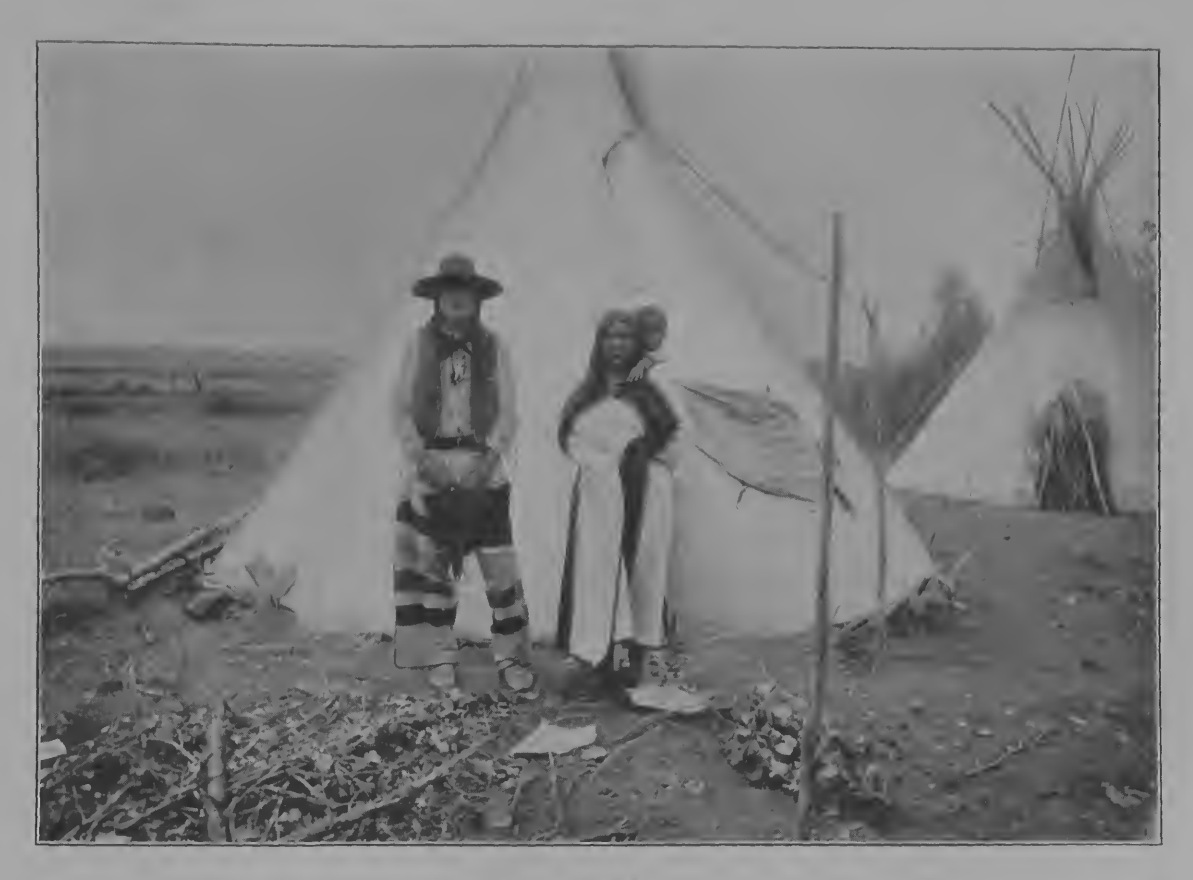
CURLY, A SURVIVOR OF THE CUSTER COMMAND IN THE LITTLE BIG HORN FIGHT, WITH HIS WIFE AND CHILD