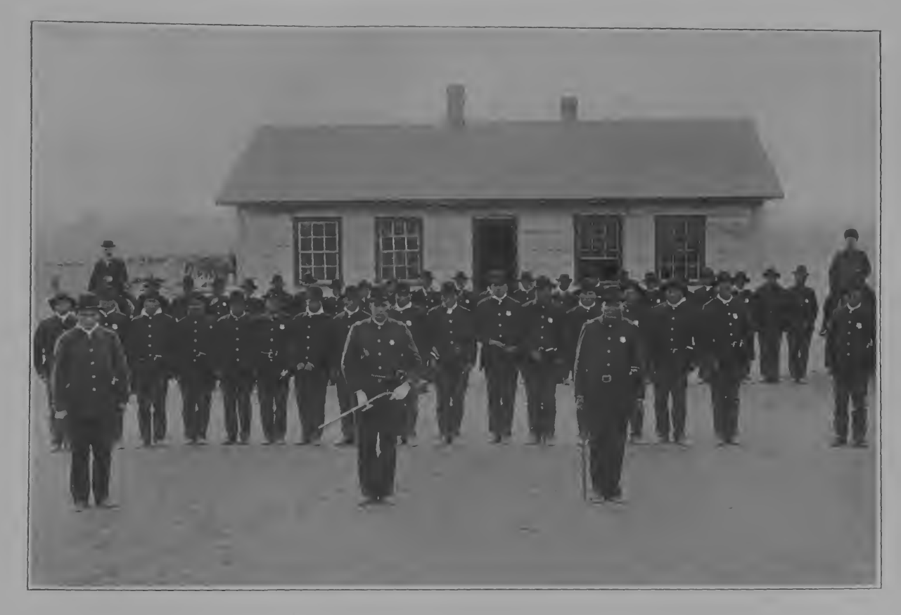
THE STANDING ROCK INDIAN POLICE, SURVIVORS OF THE SITTING BULL FIGHT Taken five days after the death of Sitting Bull. Major McLaughlin is seen mounted in the left background