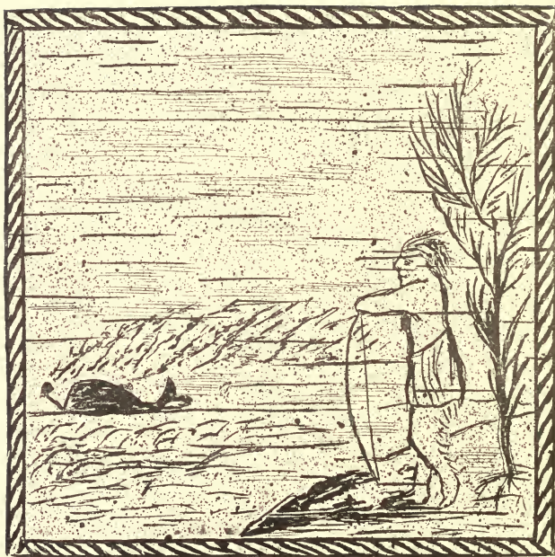
GLOOSKAP LOOKING AT THE WHALE SMOKING HIS PIPE.