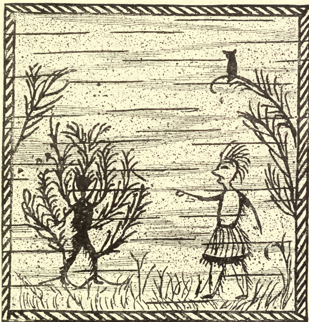
GLOOSKAP TURNING A MAN INTO A CEDAR-TREE