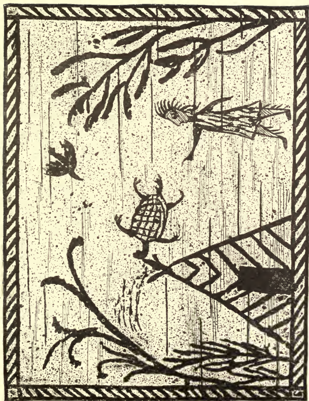
THE MUD-TURTLE JUMPING OVER THE WIGWAM OF HIS FATHER-IN-LAW.