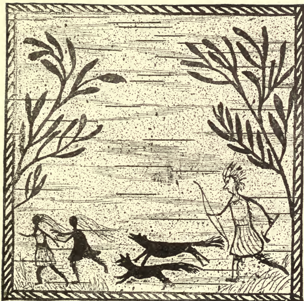
GLOOSKAP SETTING HIS DOGS ON THE WITCHES.