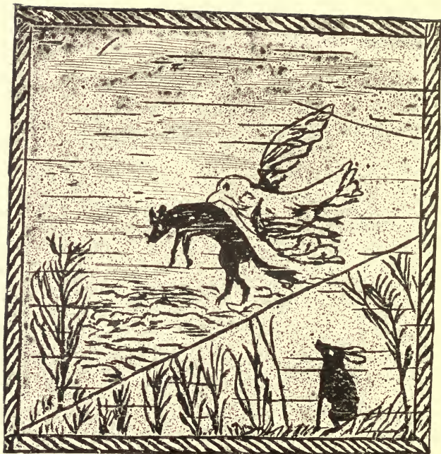
LOX CARRIED OFF BY CULLOO.