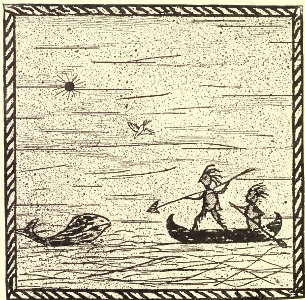
GLOOSKAP AND KEANKE SPEARING THE WHALE.