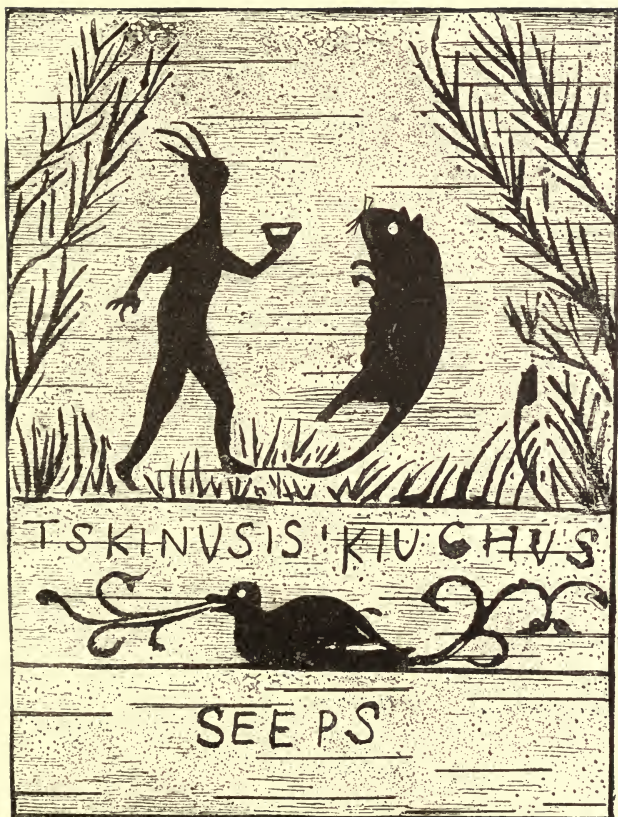
THE INDIAN BOY AND THE MUSK-RAT. SEEPS, THE DUCK.