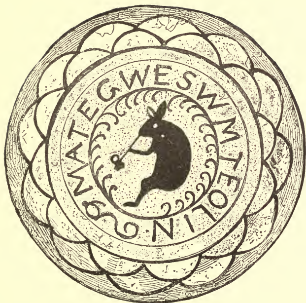
THE RABBIT MAGICIAN.