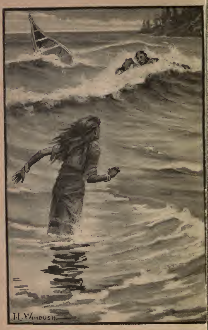
"BRAVELY AND CAREFULLY SHE STRUCK OUT FOR THE SHORE."-p. 64.