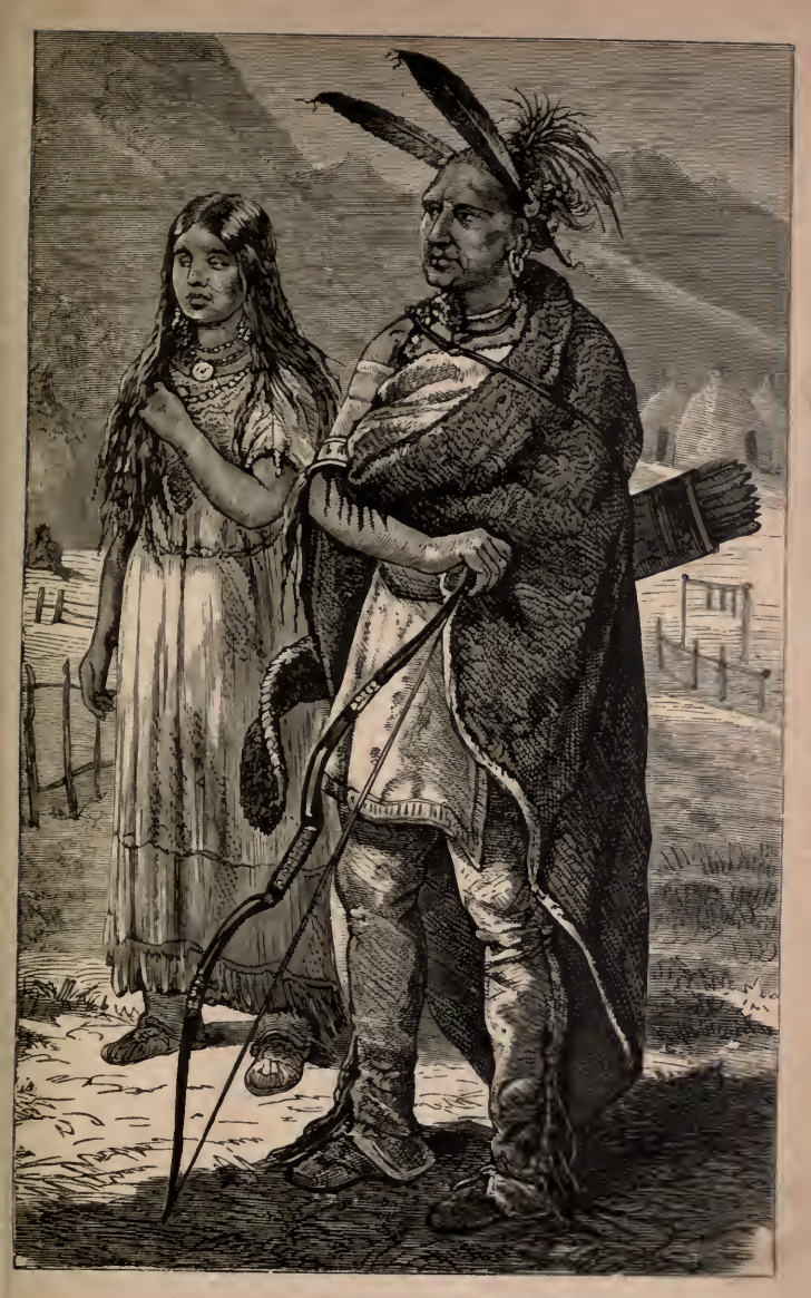
A SAULTEAUX INDIAN AND HIS DAUGHTER.