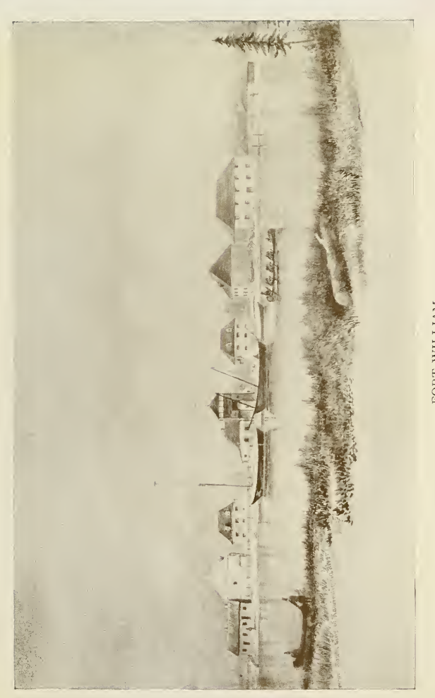
From an old print in the John Ross Robertson Collection, Toronto Public Library FORT WILLIAM