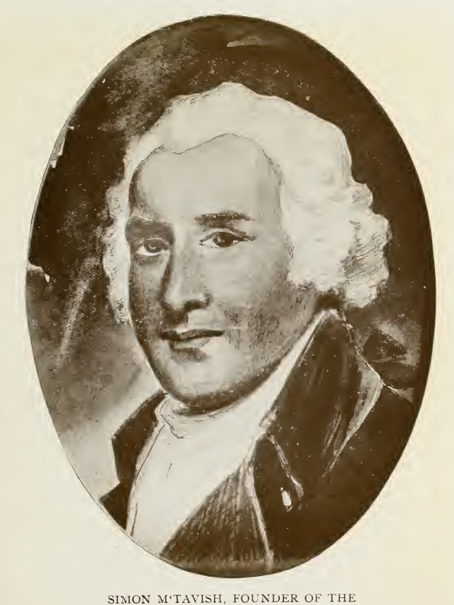
NORTH-WEST COMPANY From a water-colour drawing in M'Gill University Library