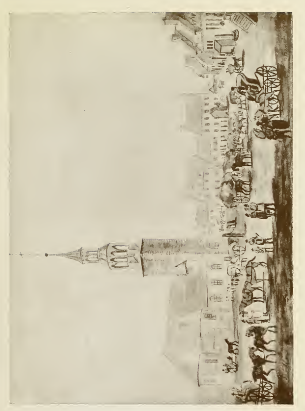
From a water-colour sketch after Dillon in M'Gill University Library PLACE D'ARMES, MONTREAL, IN 1807