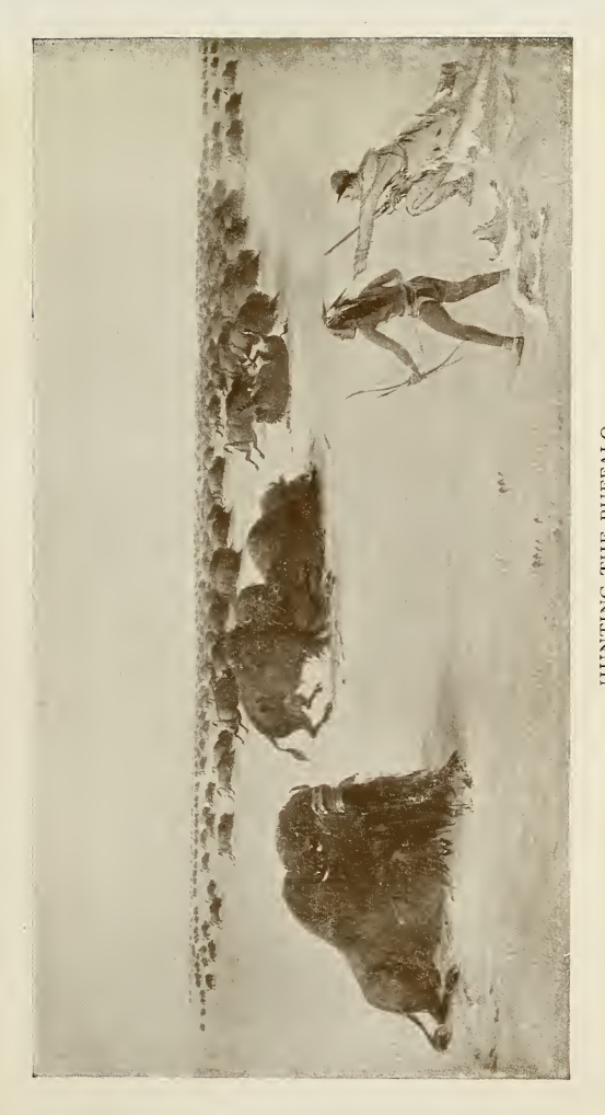
HUNTING THE BUFFALO From a painting by George Catlin