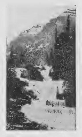
Giant Steps, Paradise Valley

Outing and Camping trips may be arranged with local outfitters, who will supply guides, ponies, tents, and all necessary equipment. Among the popular trips are:—Spray lakes, 25 miles; Kananaskis lakes, 50 miles; Sawback lake, 25 miles; Twin lakes, 4\frac{1}{2} miles from Castle; Boom lake, 3 miles from Banff-Windermere Road. All of these waters afford good sport.