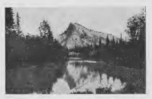
Mt. Rundle and Vermilion Lakes, Banff

Camp Rundle: Beautifully situated on the right bank of the Spray, near the confluence of the Spray and Bow rivers, reached by the Golf Links road. About one mile from Banff and within a short distance of Golf Links and C.P.R. Hotel. Light, water, stoves, tables and other accessories are installed. There is also a daily inspection by a competent sanitary officer.