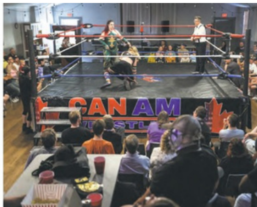
The Elks Community Hall has been a community hub since it opened in 1927, serving as a place for everything from weddings and funerals to craft fairs and wrestling matches. CanAm Wrestling moved to the hall earlier this year.