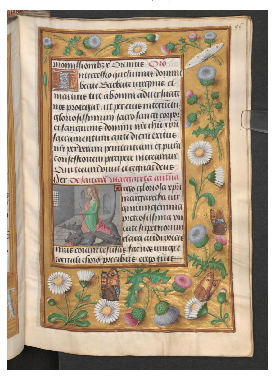
Fig. 3: Gebetbuch Jakobs IV. von Schottland, c .1500, http://data.onb.ac.at/dtl/3044203 / Austrian National Library, ONB/Vienna Cod. 1897, fol. 56r.