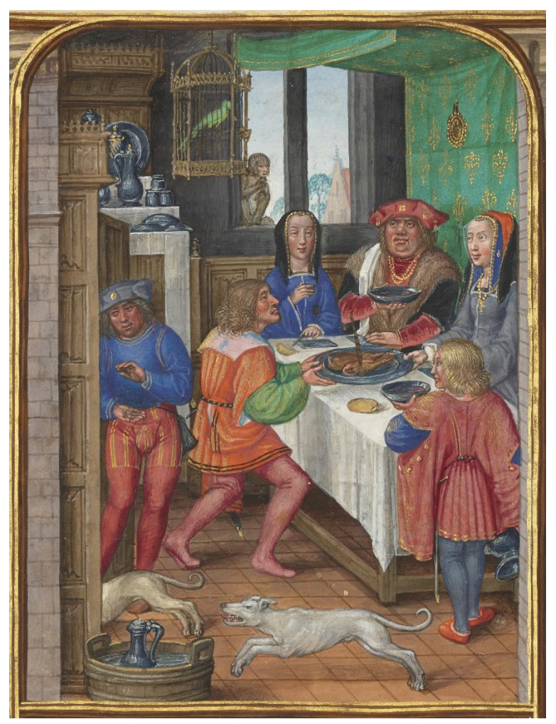
Fig. 2: Master of James IV of Scotland (Flemish, before 1465 – about 1541), The Feast of Dives, about 1510–1520, Tempera colors, gold, and ink on parchment. Leaf: 23.2 \times 16.7 cm (9 1/8 \times 6 9/16 in.), Ms. Ludwig IX 18 (83.ML.114), fol. 21v (detail). The J. Paul Getty Museum, Los Angeles, Ms. Ludwig IX 18, fol. 21V.

Silversmith, 1430–1830, 2 vols (London: Sotheby Parke Bernet, 1977), vol. 1: Text, 175.