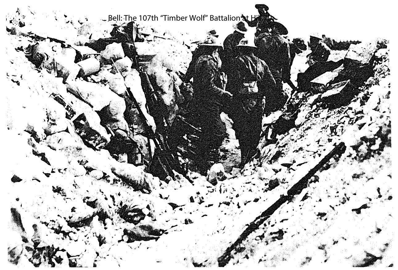
Canadian soldiers rest in the German trenches on Hill 70 following the battle.