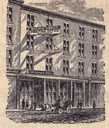
WHOLESALE AND RETAIL